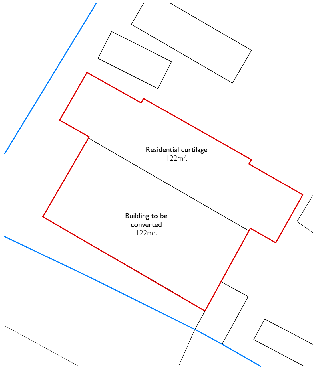
Block Plan Scale 1:1200 @ A3