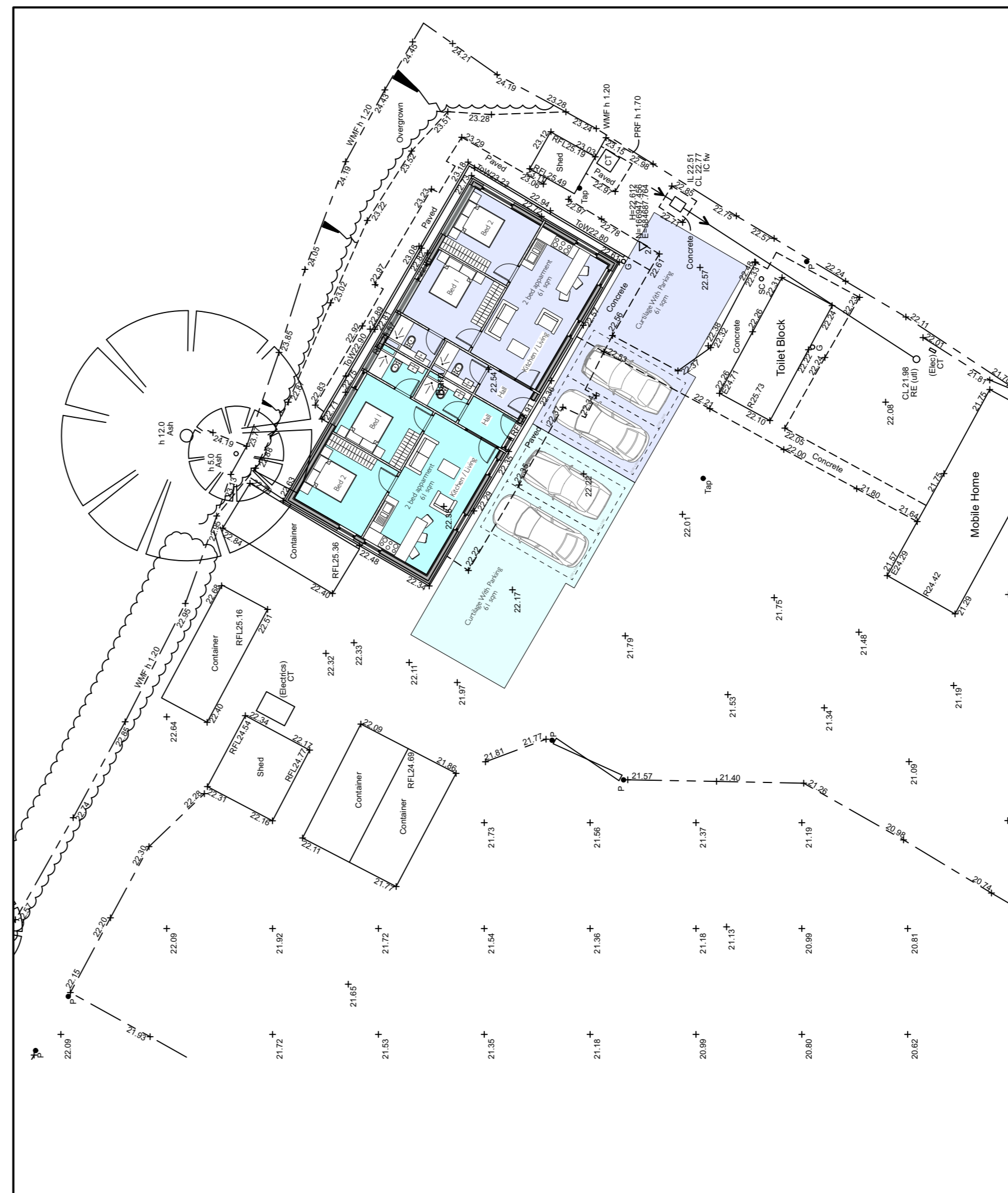
Proposed Site Plan 1:200 @ A1