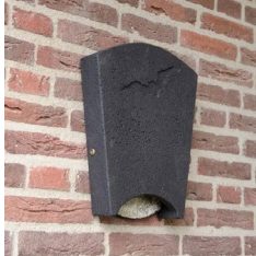
2 Number Beaumaris WoodStone Bat Box Midi Bat Boxes. Product code SKU 910200120