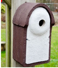
2 Number WoodStone® Starling Nest Box. Product code SKU 906160120