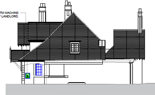
Proposed West Elevation

INDICATIVE POTENTIAL GLAZING VINYLs. SUBJECT TO SEPERATE PLANNING APPLICATION.