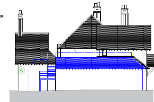
Proposed East Elevation

APPROXIMATE LOCATION OF SATELLITE DISH TO BE INSTALLED BY TESCO. SUBJECT TO PLANNING APPROVAL THROUGH TESCO. WALL MOUNTED TO SUPPLIERS DETAILS.