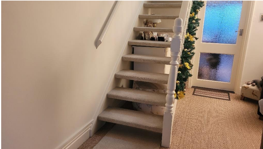
(Image 2 – Modern staircase installed 1973, balustrading changed circa 1985)