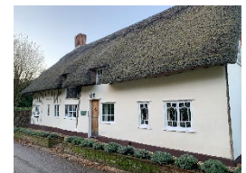
Trent Cottage/ Rose Cottage