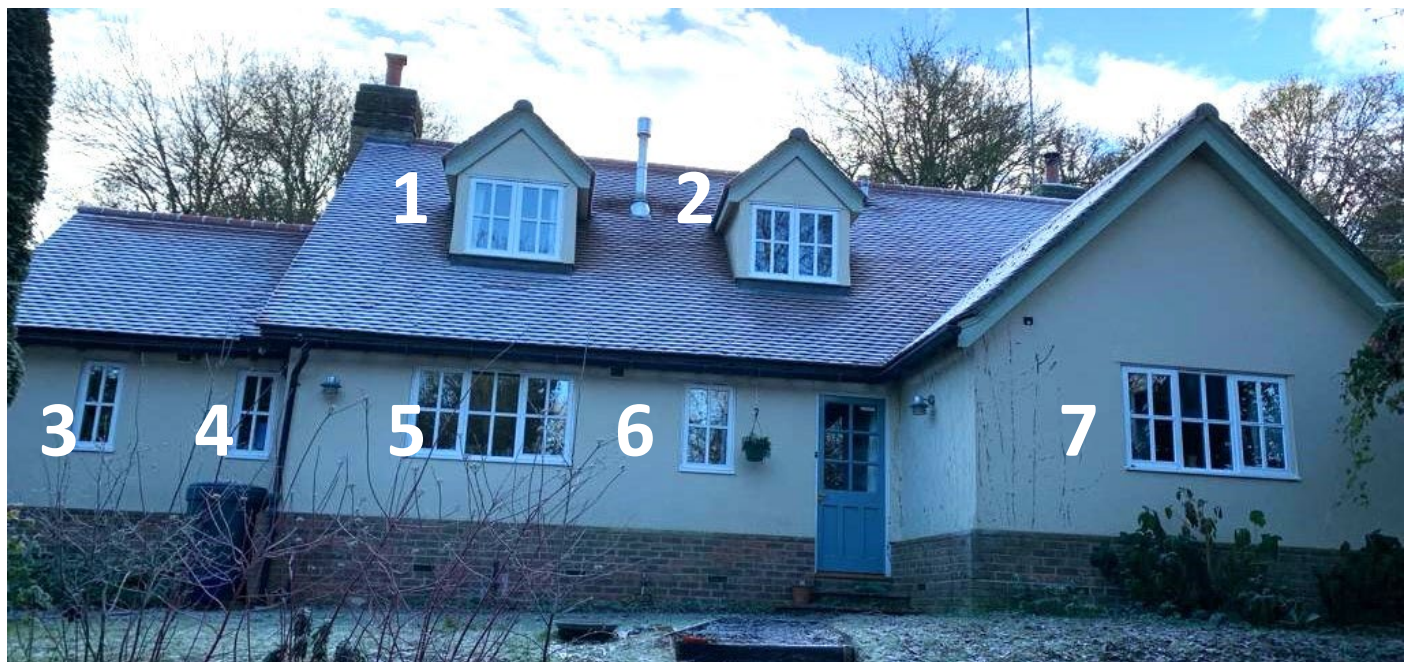
Windows to be re-glazed on the front elevation.