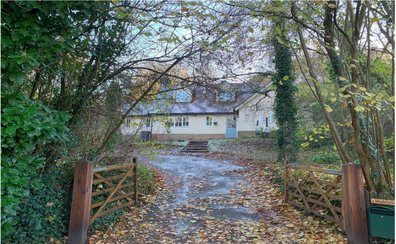
View from the lane