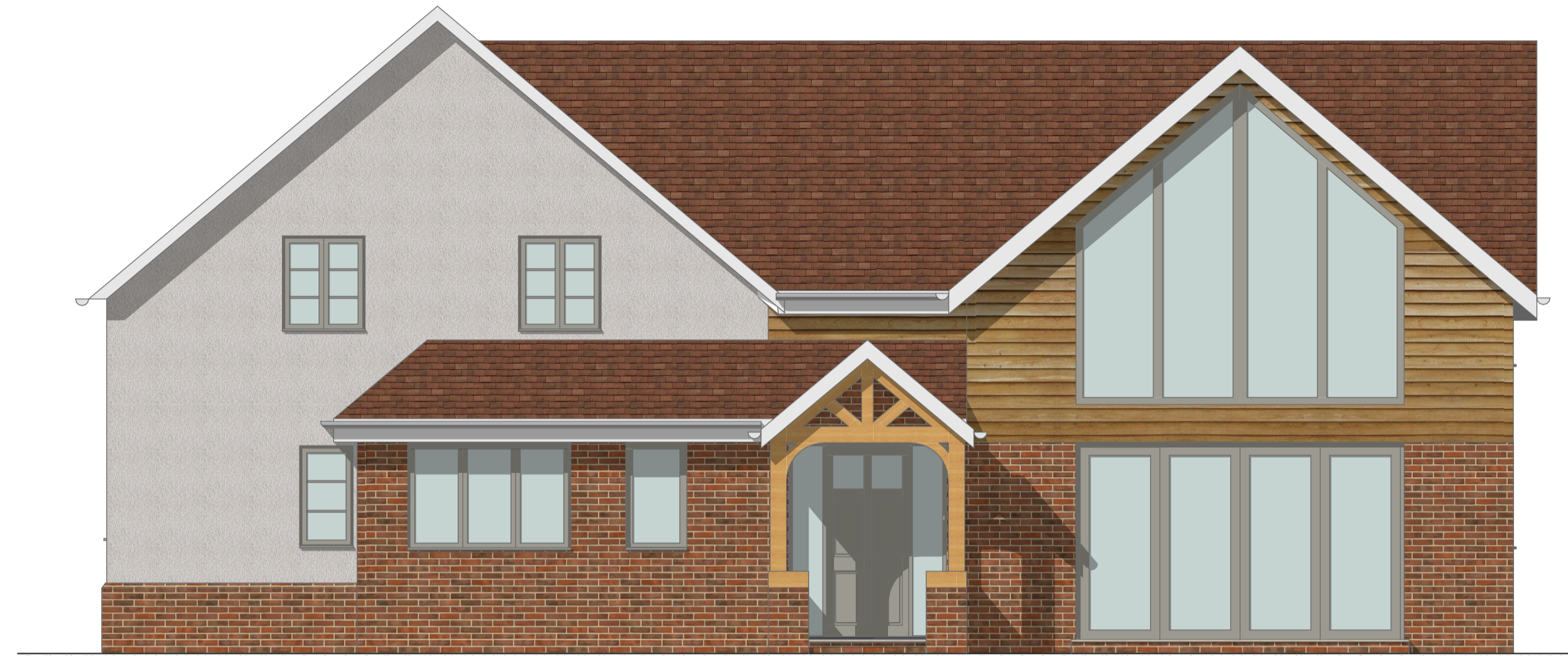
E-1 FRONT ELEVATION 1:50