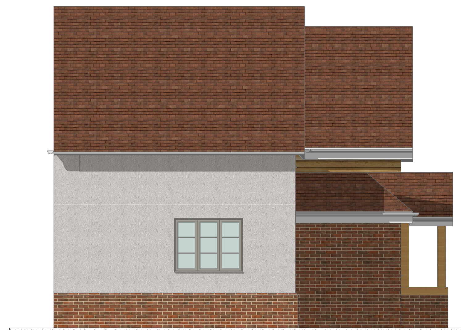
E-3 SIDE ELEVATION 1:50