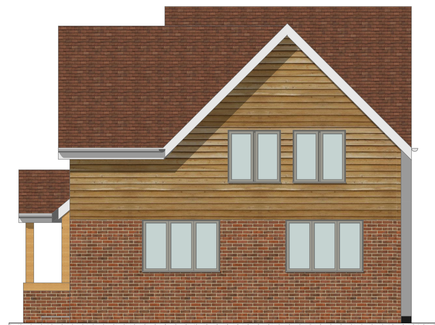
E-4 SIDE ELEVATION 1:50