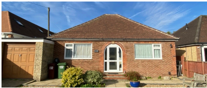
Built Context - 132 Old Kempshott Lane - Single storey