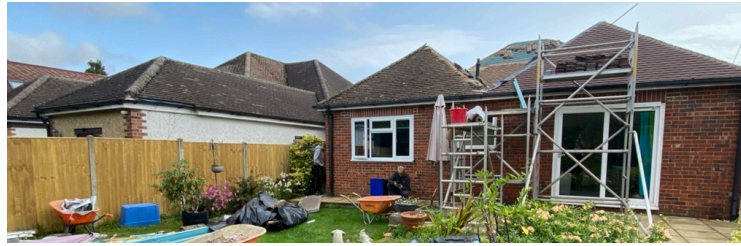
Built Context - 130 Old Kempshott Lane - Single storey

132 Old Kempshott lane Permission to erect single storey extension to existing property. To provide essential accessible DDA living facilities with access to garden.