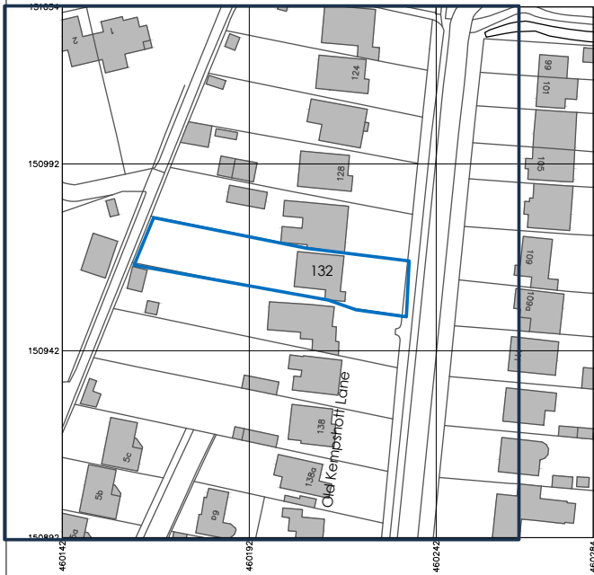
Site Location Plan Scale 1:1250@ A3

Produced on 26 September 2023 from the Ordnance Survey National Geographic Database and incorporating surveyed revision available c This map shows the area bounded by 460142 150892,460284 150892,460284 151034,460142 151034,460142 150892 Crown copyright and database rights 2023 OS 100054135. Supplied by copia ltd trading as UKPlanningMaps.com a licensed Ordnance Sur Data licence expires 26 September 2024. Unique plan reference: v2e/1006122/1356882