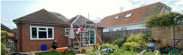
Built Context - 134 Old Kempshott Lane - Two storey

Construction and alteration to include works to below ground drainage to be in accordance and subject to Building Control review inspection and approval.