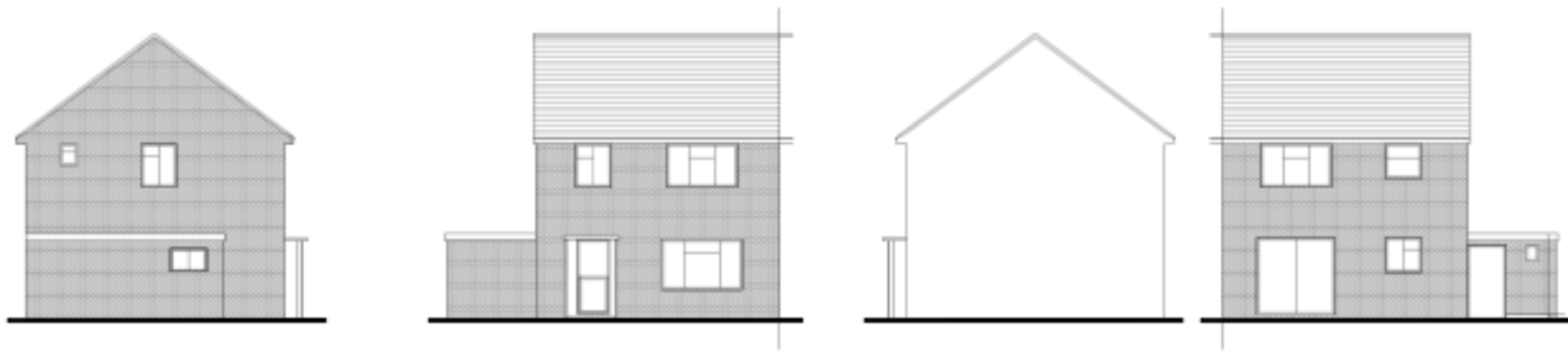
EXISTING ELEVATIONS 1:200