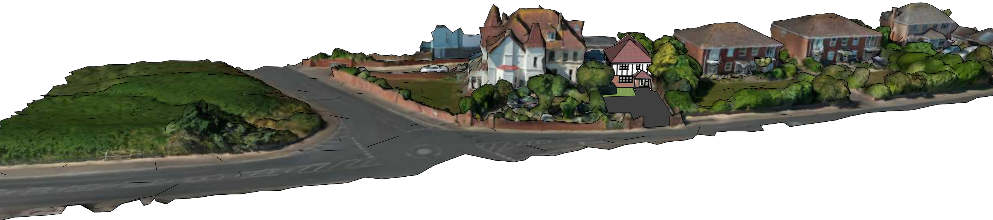
PROPOSED AERIAL VIEW

PROPOSED STREET SCENE PW 0010 scale: 1:100 October 31, 2023