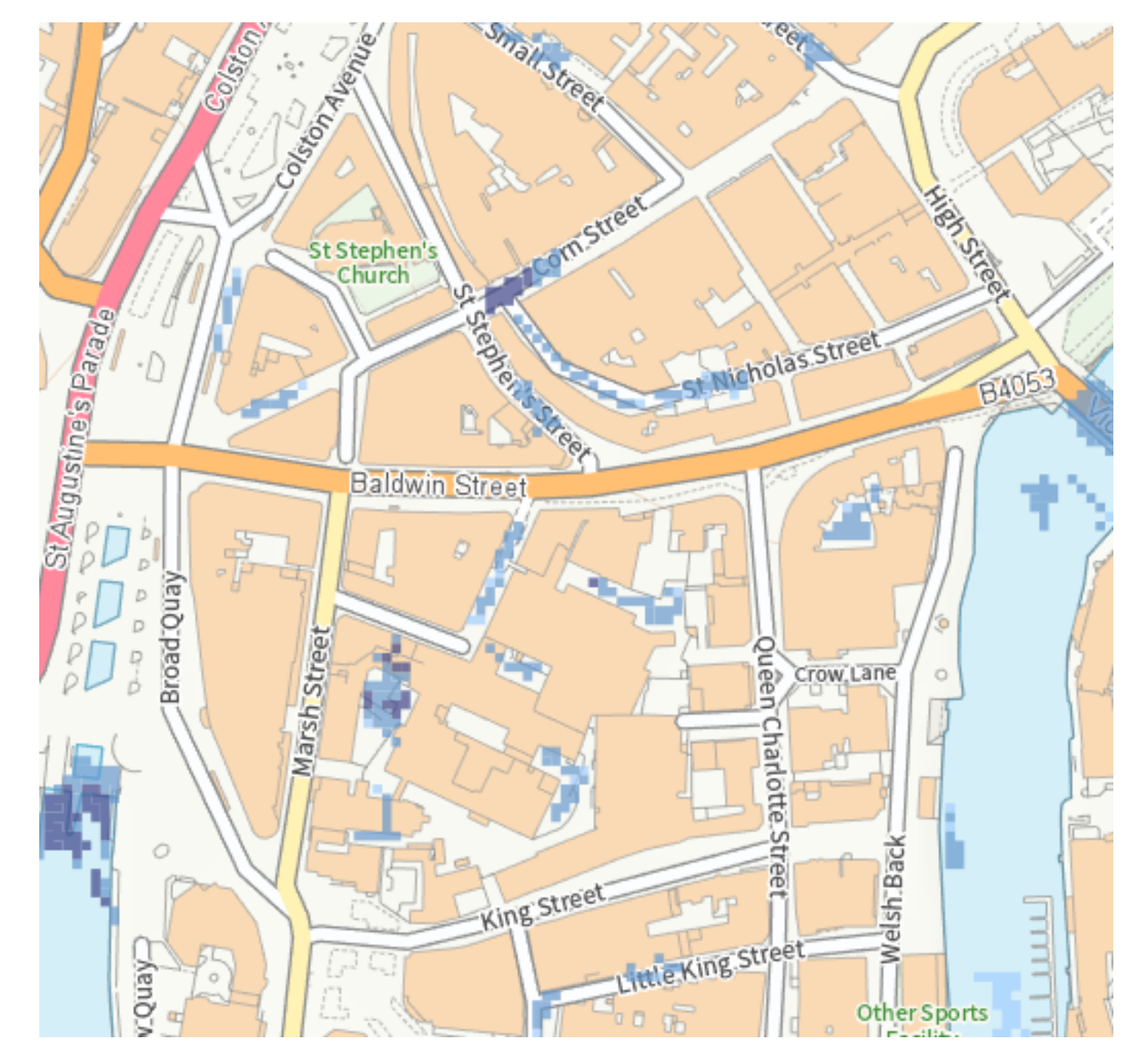
Baldwin Street—Surface Water - High Risk—Most Often

Surface water flood risk: water depth in a high risk scenario Flood depth (millimetres)