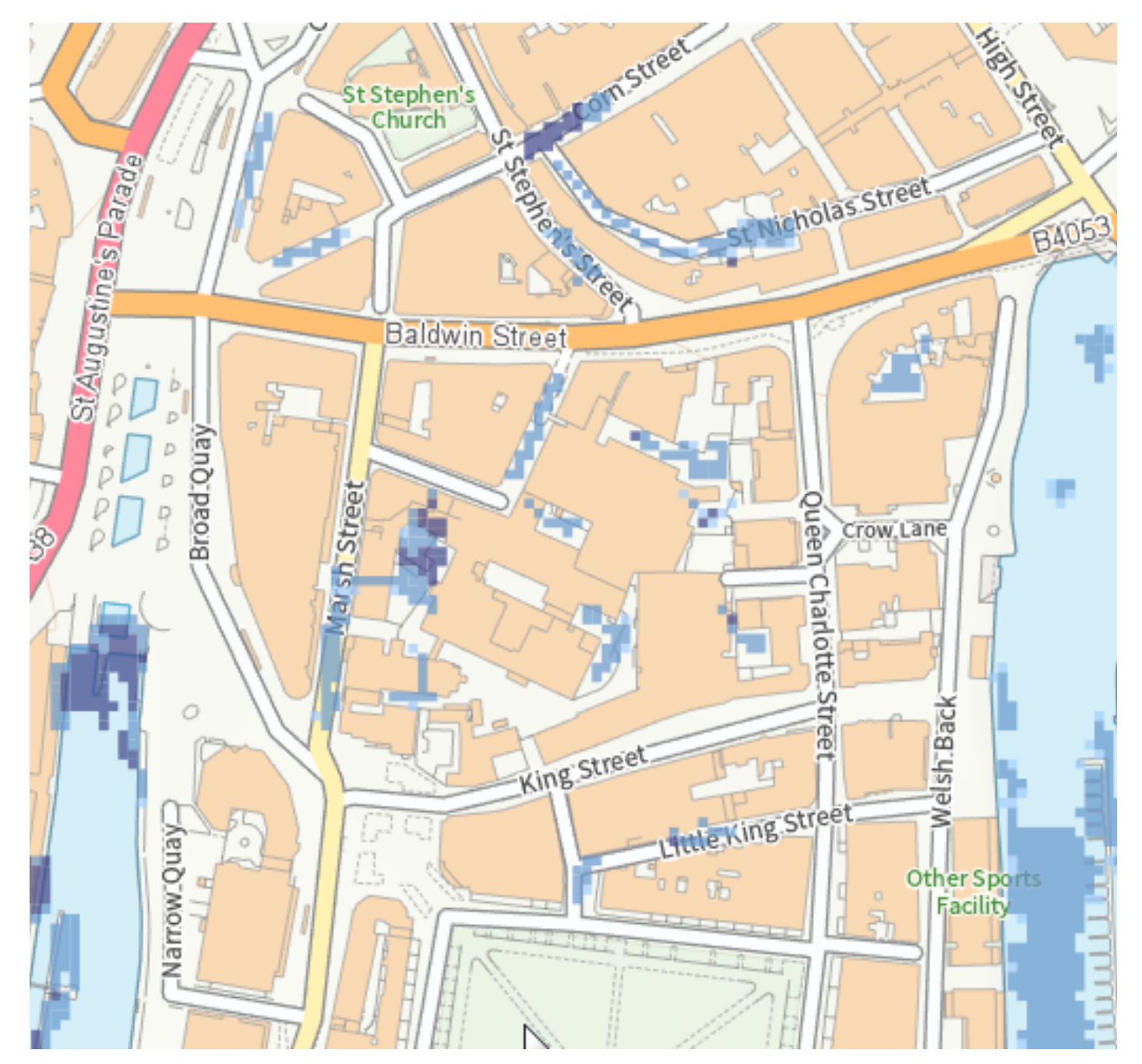
Baldwin Street—Surface Water - Low Risk— Not Often

Surface water flood risk: water depth in a low risk scenario Flood depth (millimetres)