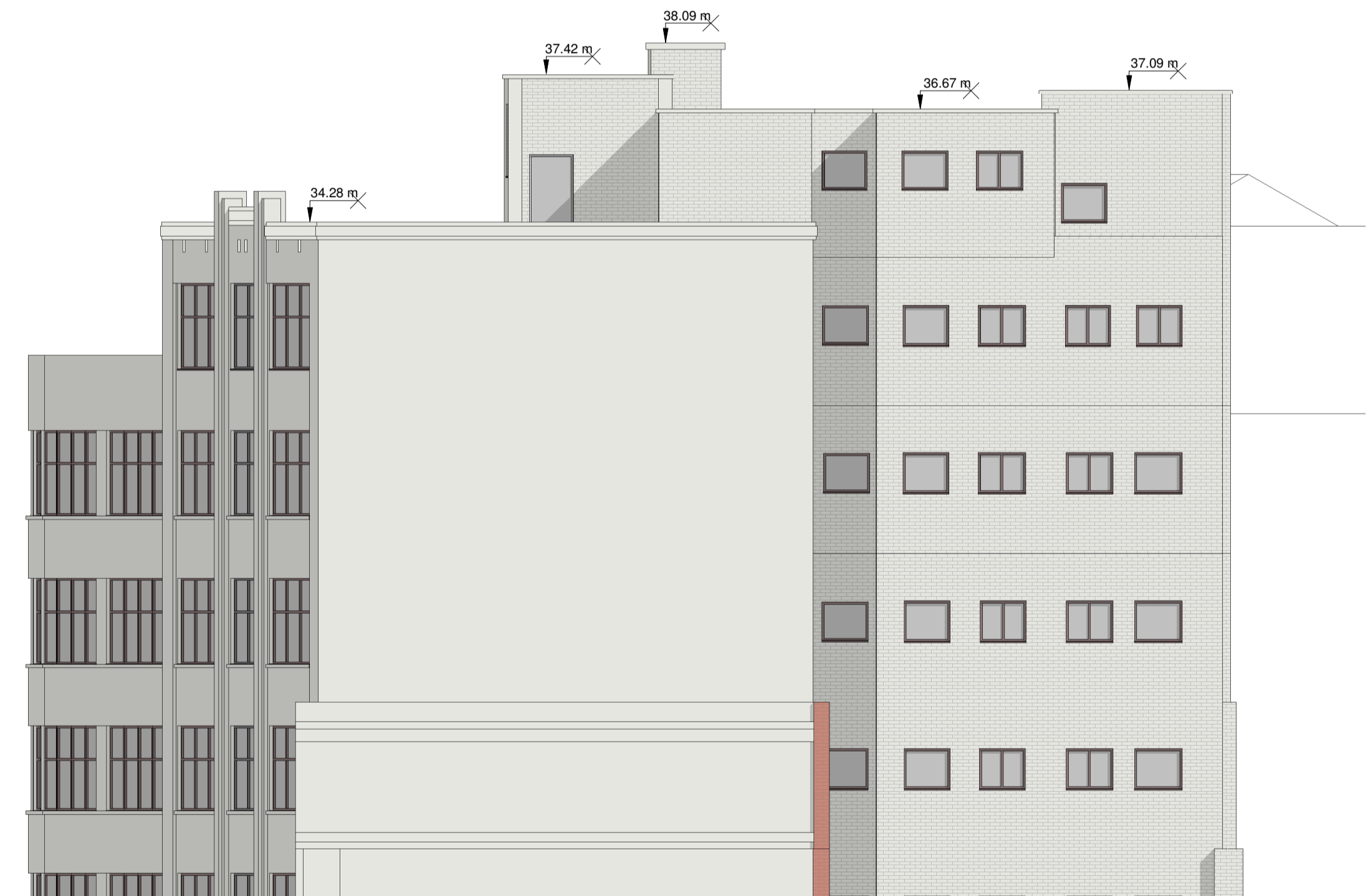
3 West Elevation Scale: 1 : 100

Disclaimer This drawing and details contained therein are copyright and are not to be reproduced without obtaining permission. All dimensions and levels relating to actual site conditions are to be checked on site prior to any work being commissioned or executed. Contractors are not to scale from this drawing and should refer any queries in respect of dimensions to the designers.