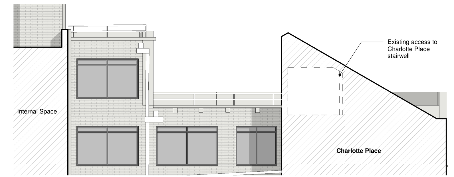
4 South Elevation Scale: 1 : 100