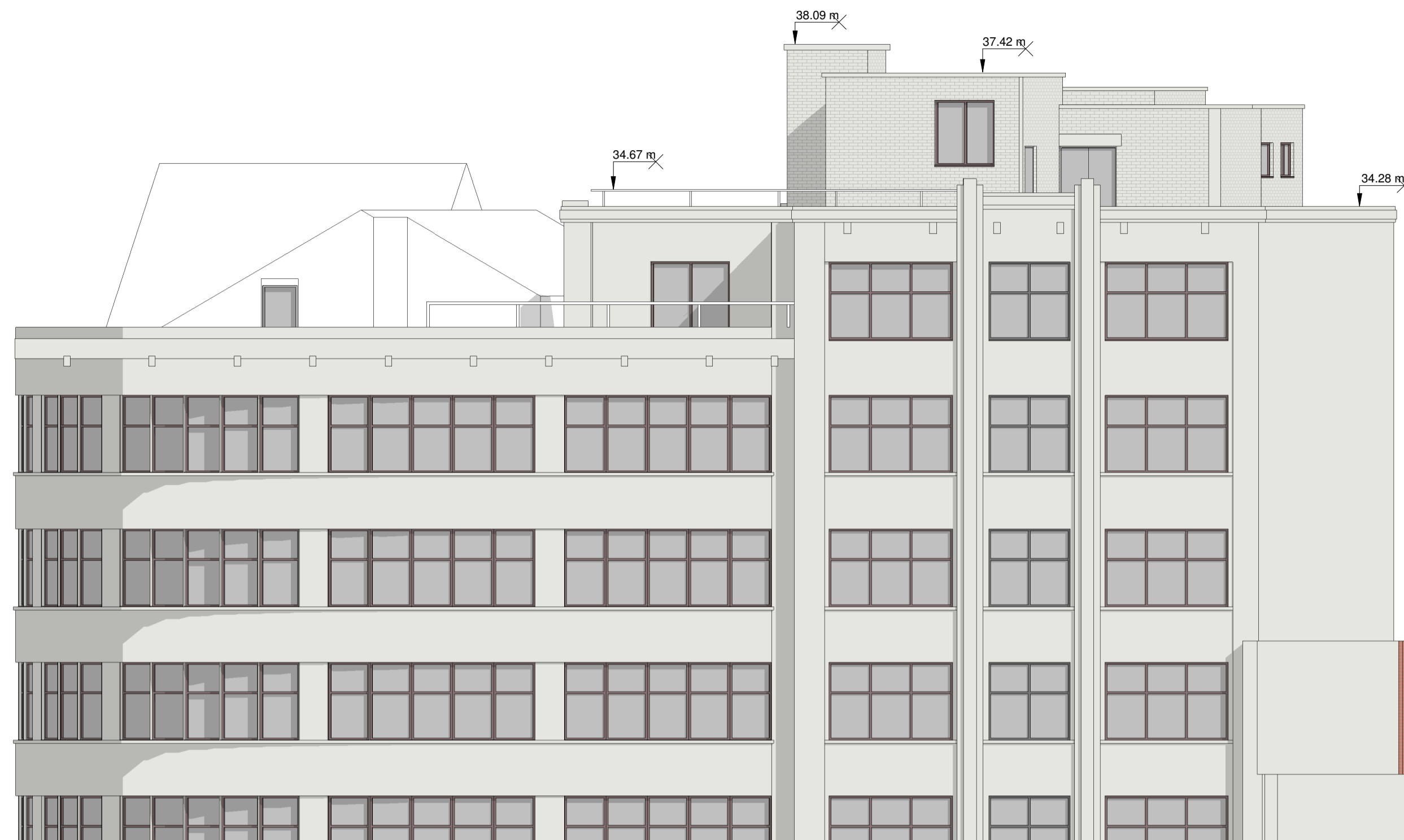
1 North Elevation Scale: 1 : 100

Bridge House (Shown indicative only) Queen Charlotte Street