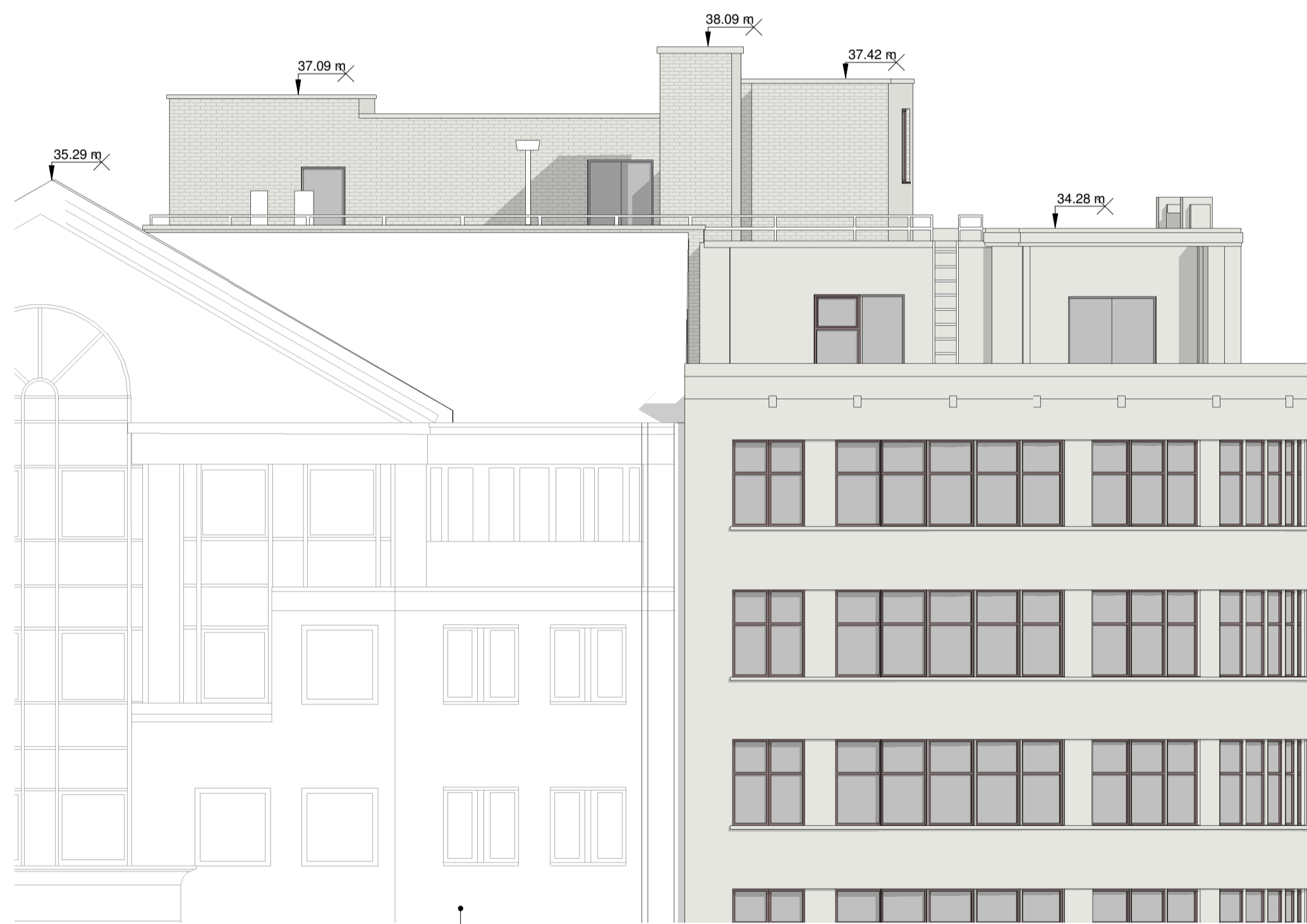
2 East Elevation Scale: 1 : 100