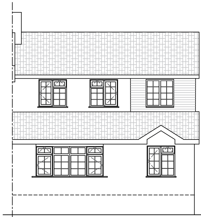
LEFT-HAND SIDE ELEVATION