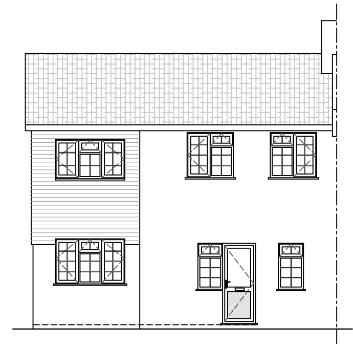
RIGHT-HAND SIDE ELEVATION