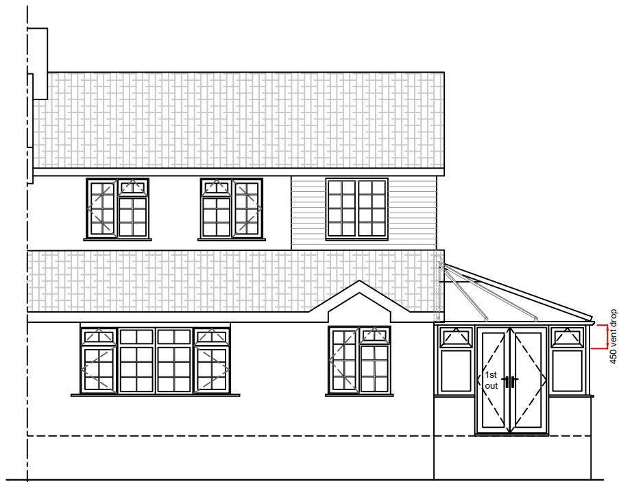
LEFT-HAND SIDE ELEVATION