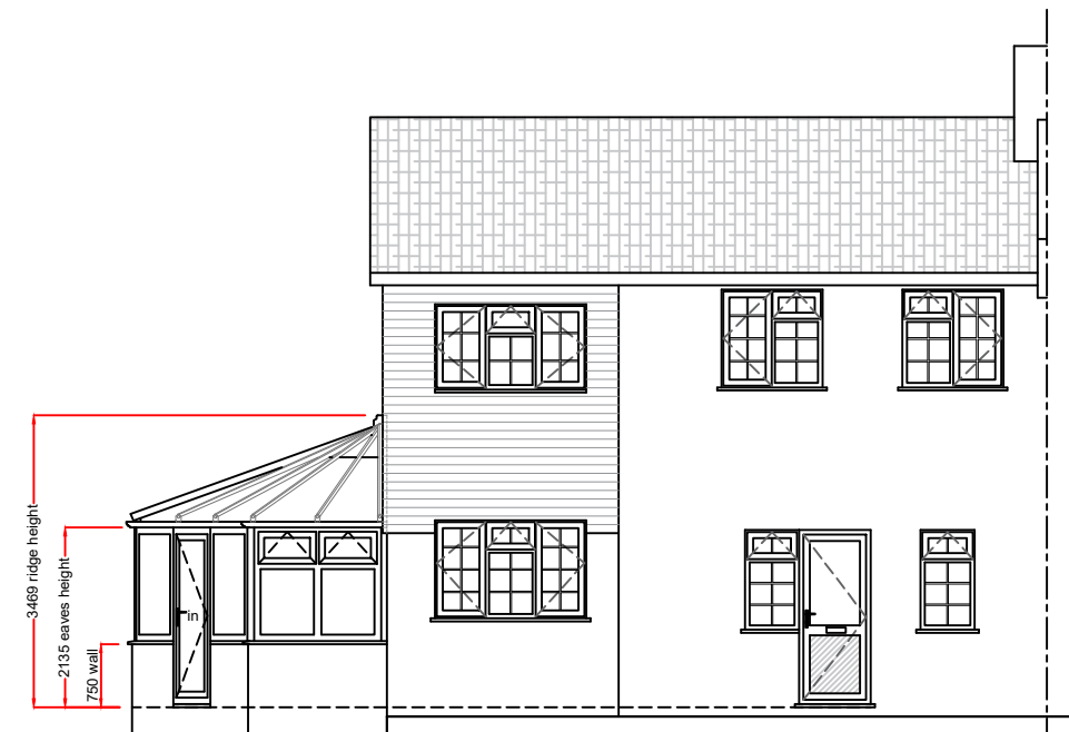
RIGHT-HAND SIDE ELEVATION