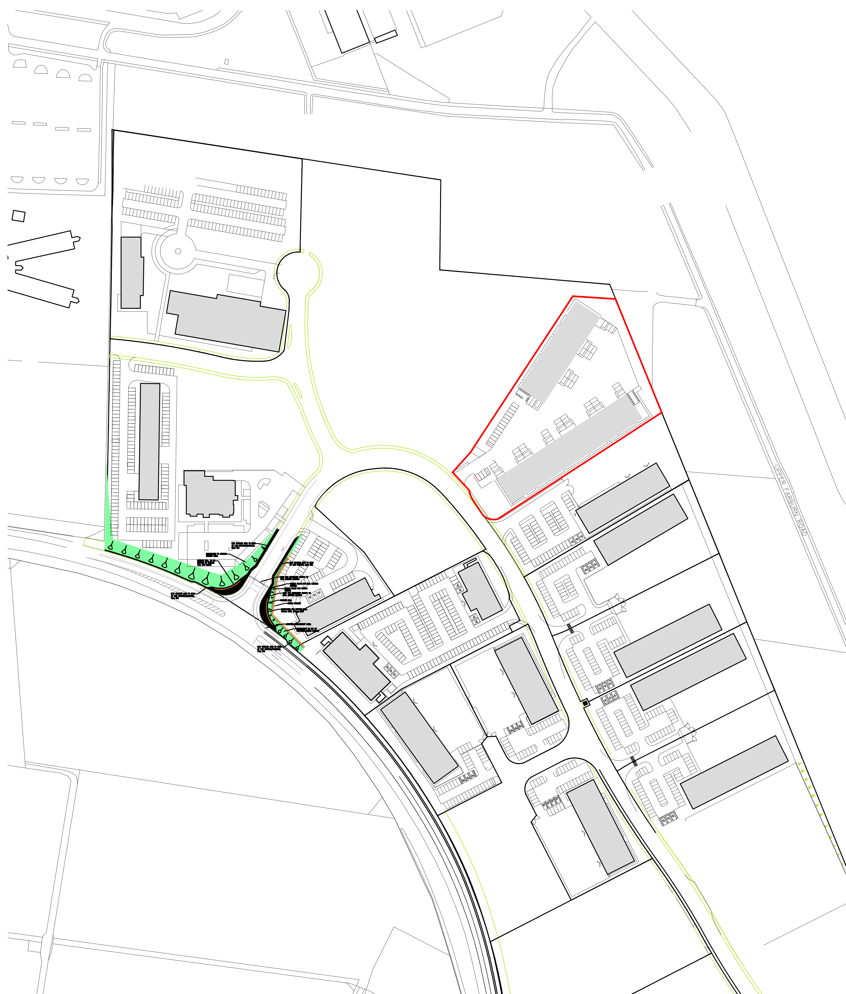
Location Plan - 1:1250