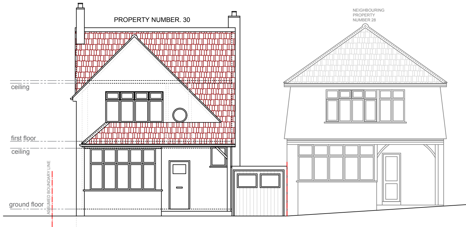
8 FRONT ELEVATION - EXISTING 1:100