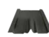
Top Closure Piece 90°