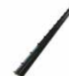
Over Fascia Ventilator 10mm or 25mm x6