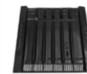
Felt Support Tray x10

The Eaves Vent System 6m is available as either a 2 part or 3 part system providing a 10mm or 25mm ventilation gap.