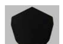
Multi Ridge End Cap