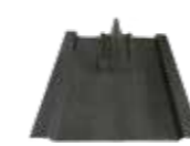
Eaves Closure Piece