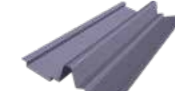
GRP Dry Fix Valley Trough 3m

Minimum Pitch: As per tile profile Maximum Pitch: 60°