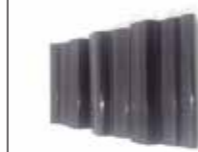
Roll Out Rafter Eave Vent 300mm x 6m