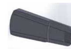
Dry Verge Unit