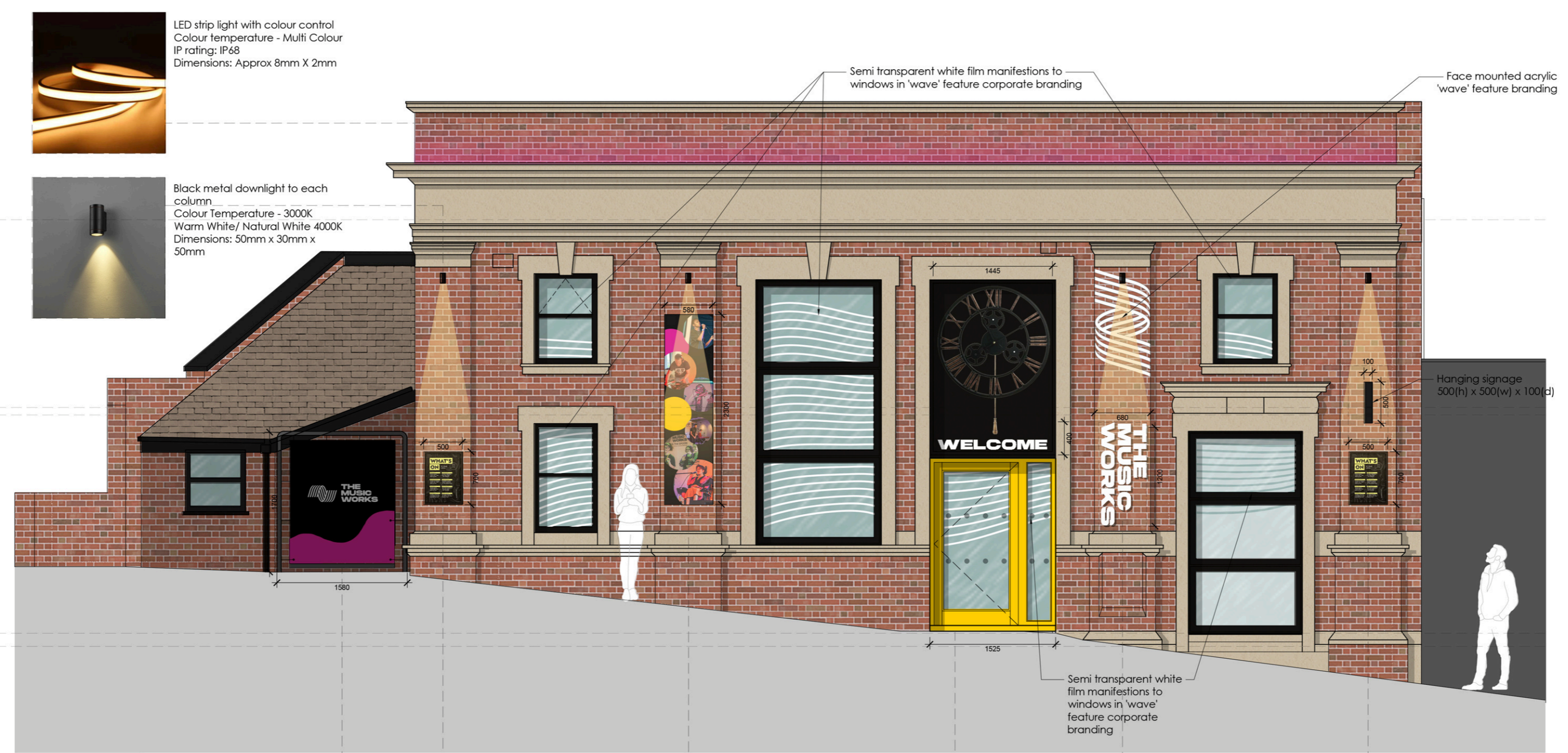
50.00 Arbitrary Datum Elevation A

General Notes Drawing based on Ordnance Survey and Measured Survey data. Responsibility is not accepted for errors made by others in scaling from this drawing. All drawings are intended for use for planning purposes only. Drawing to be used for Local Authority purposes or for Planning only. Measured Building Survey Drawing based on survey supplied by Site Data Ltd Client: February 2023 Drawing number: 2428