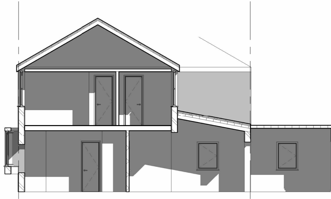
Existing Section Through 1 : 100