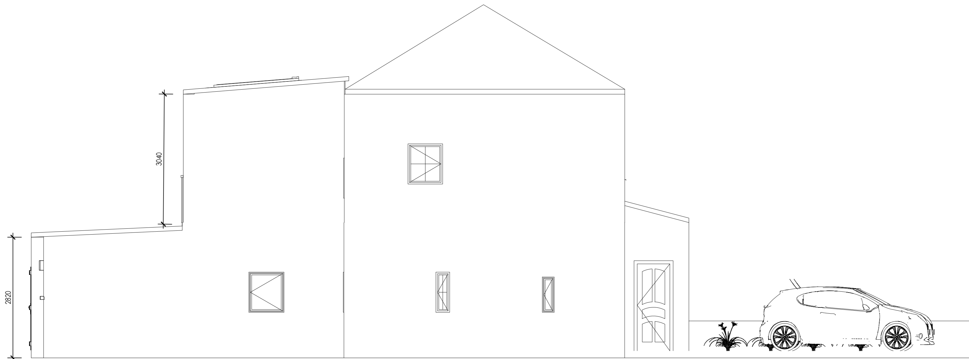
Proposal Side Elevation