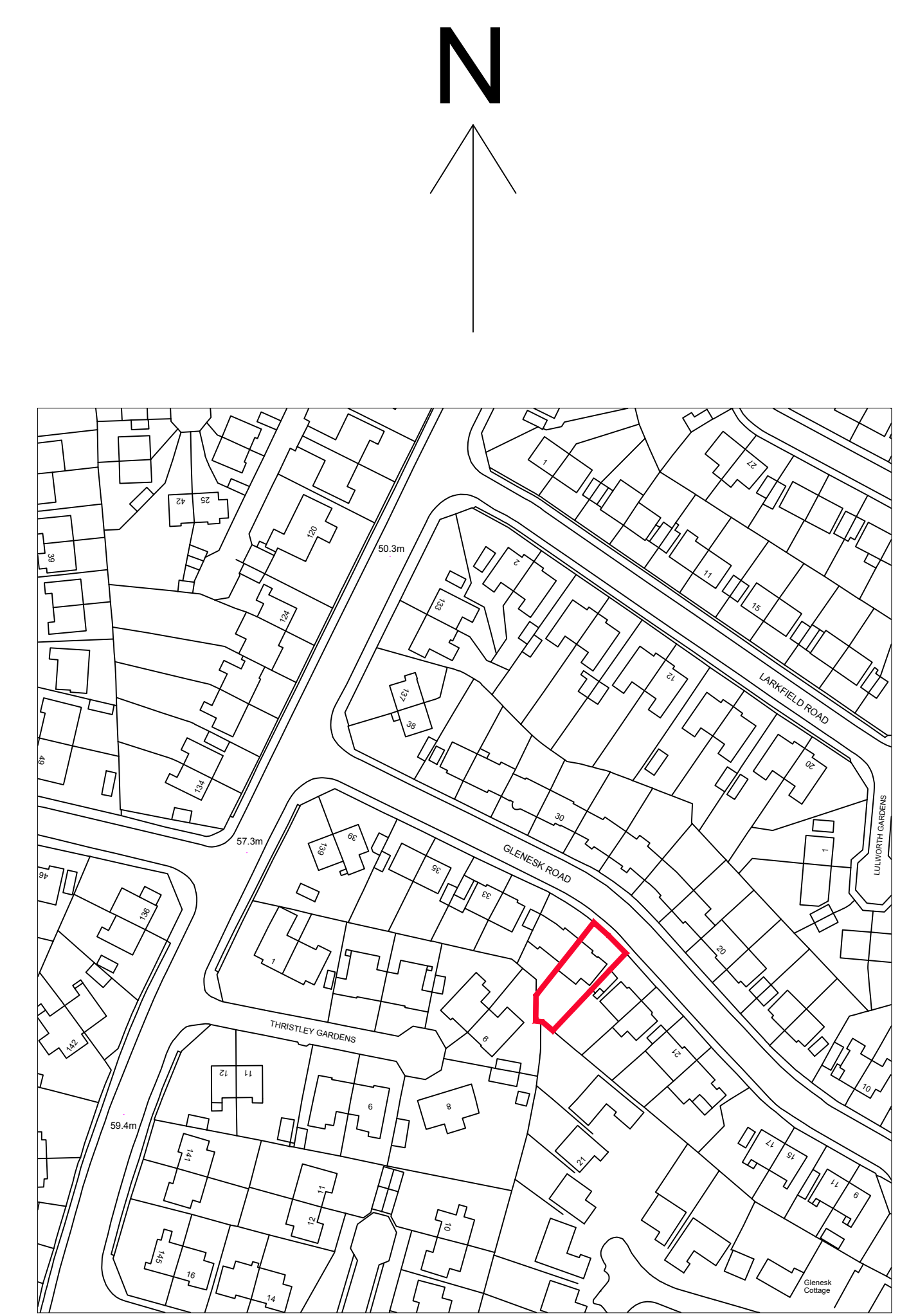
EXISTING SITE LOCATION PLAN 1:1250