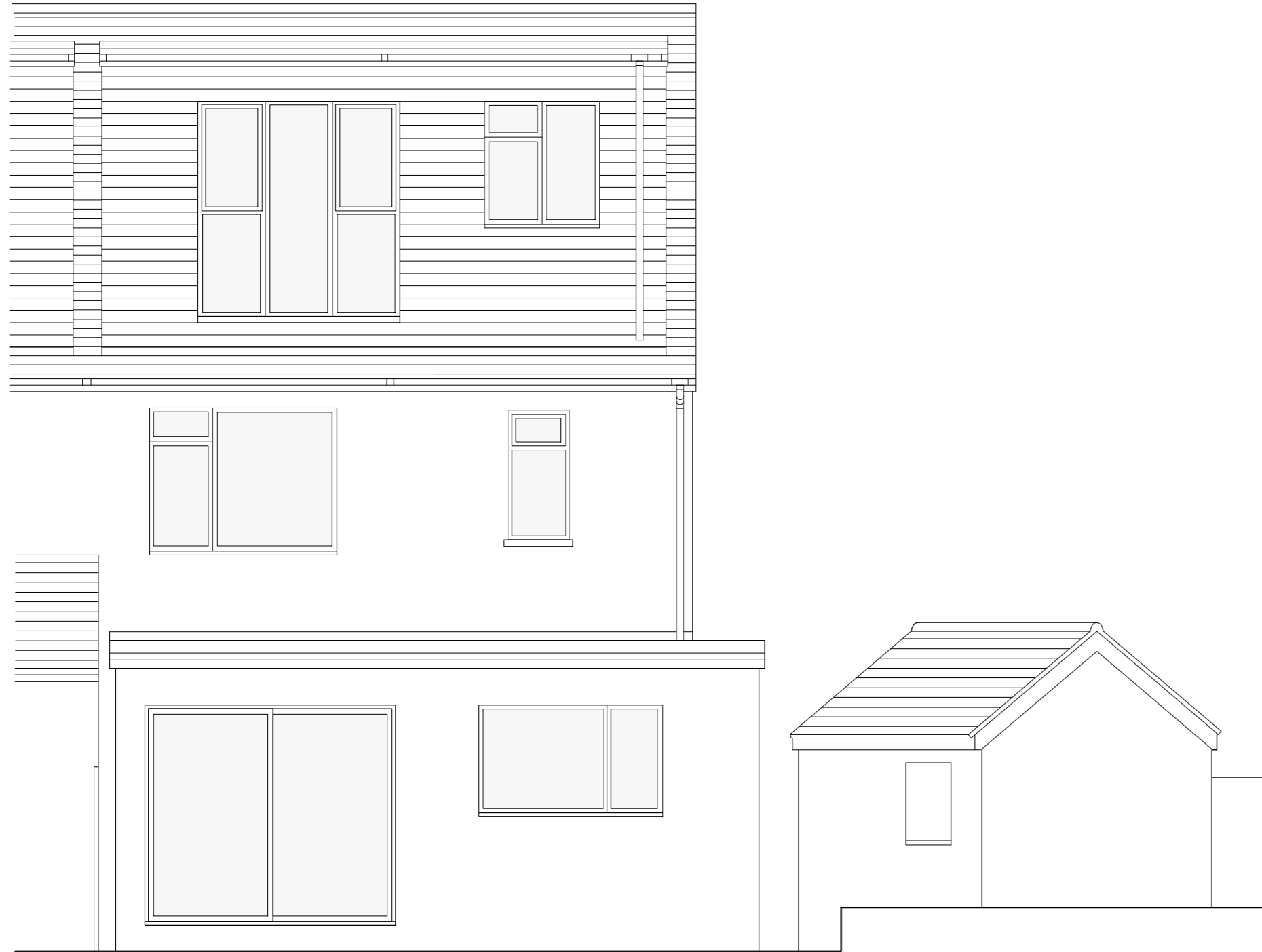
Existing Rear Elevation scale 1:50 @ A2