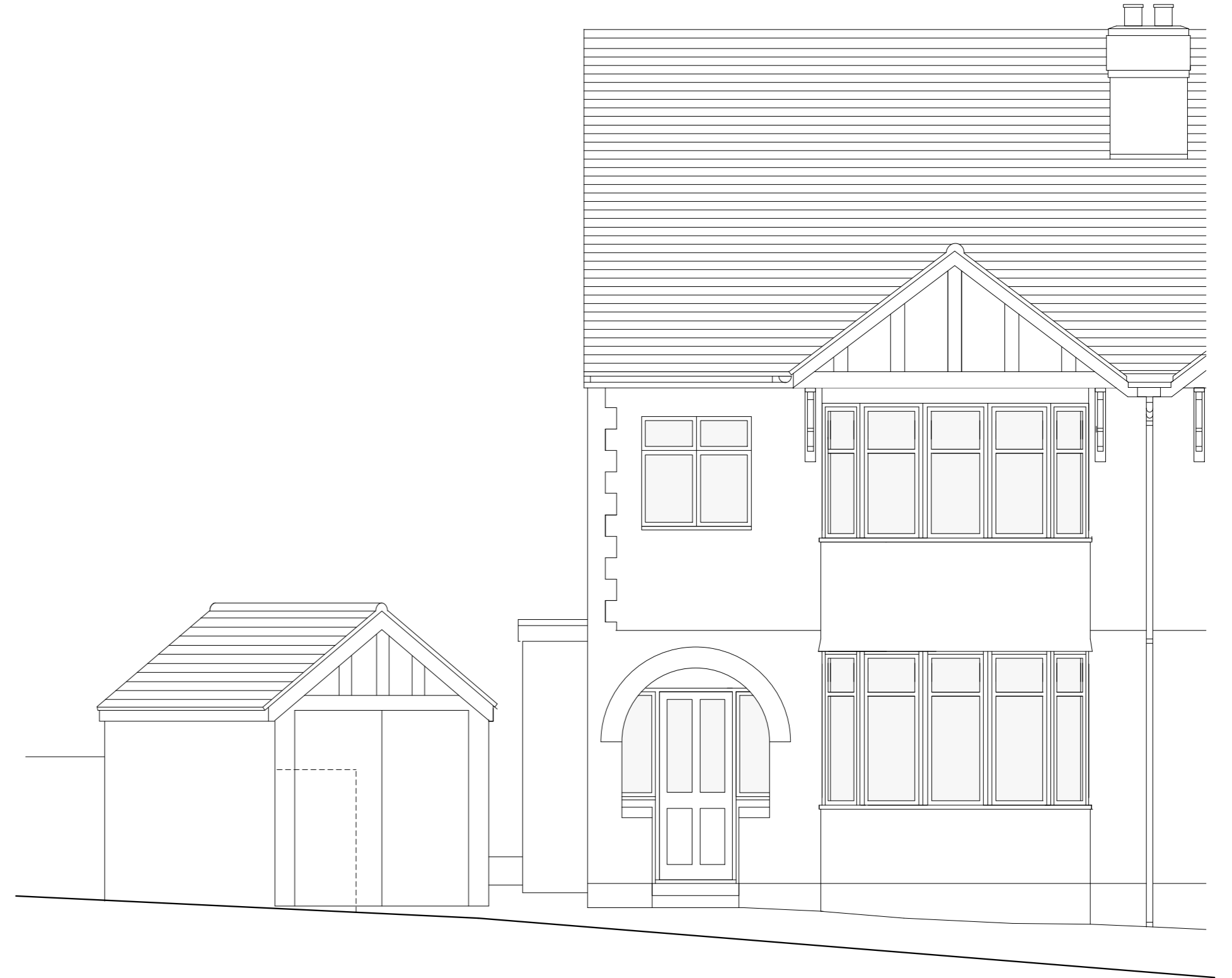
Existing Front Elevation scale 1:50 @ A2