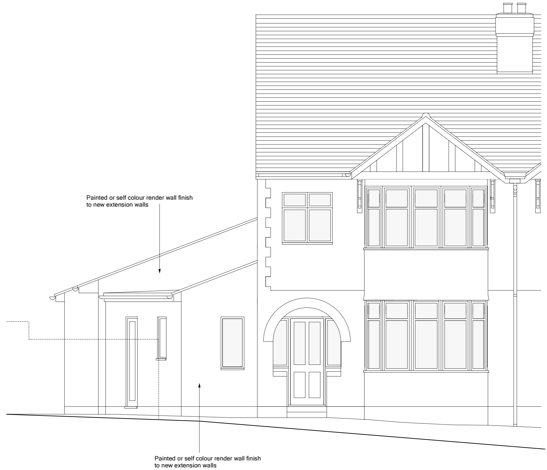
Proposed Front Elevation scale 1:50 @ A2