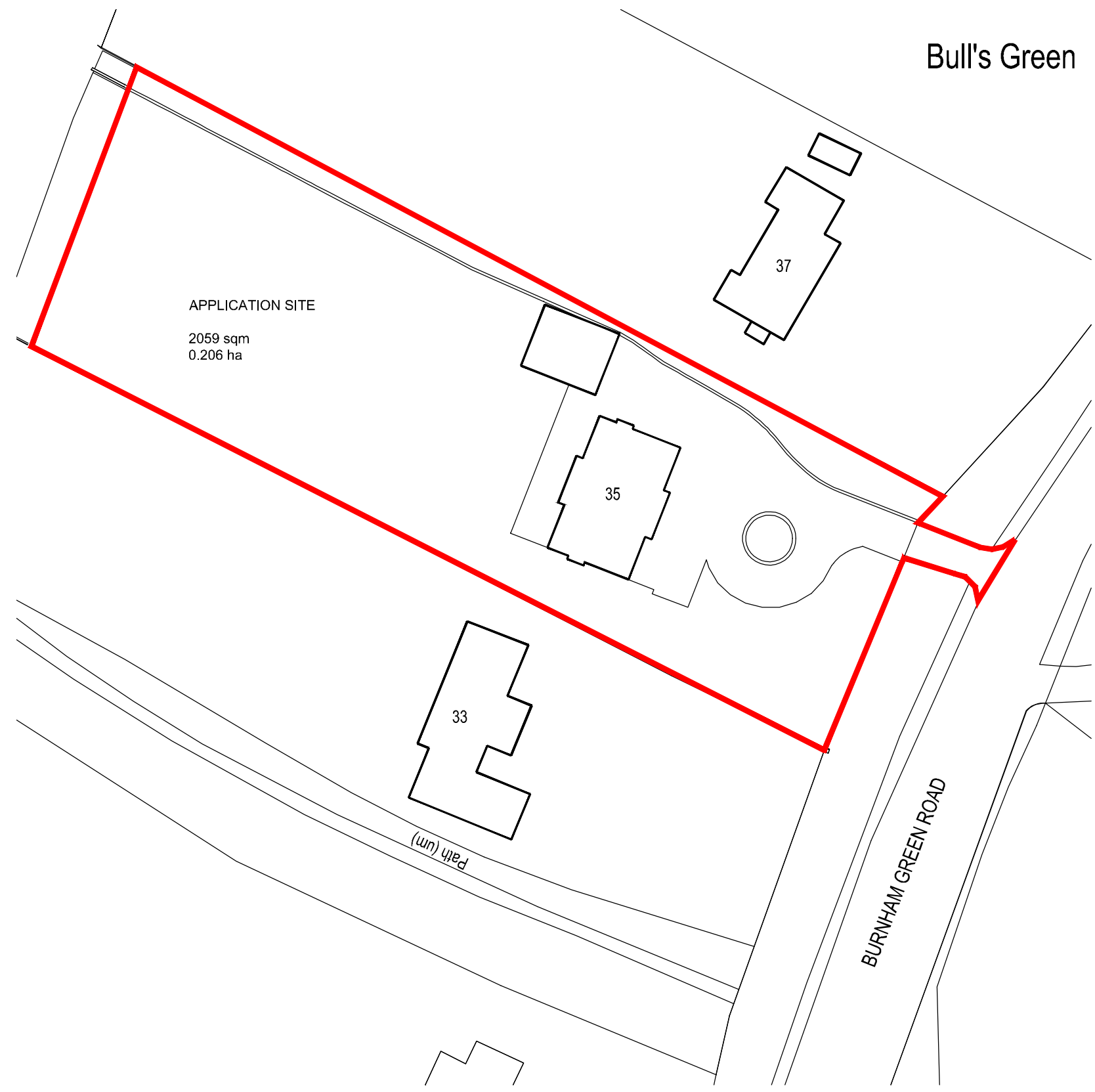
[02] BLOCK PLAN 1:500