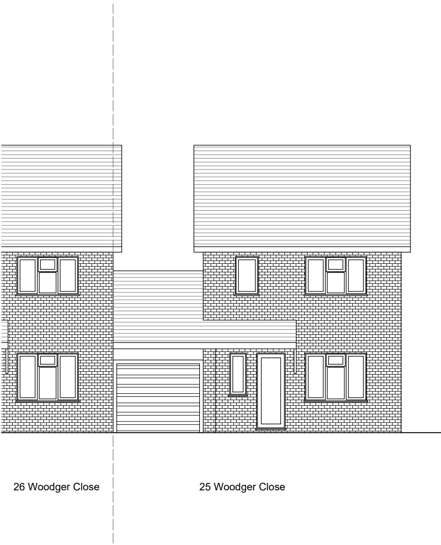
PROPOSED FRONT ELEVATION (NO CHANGE)