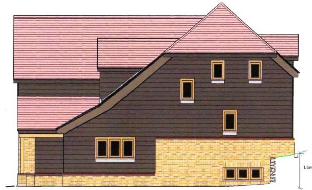
Side Elevation (NE)