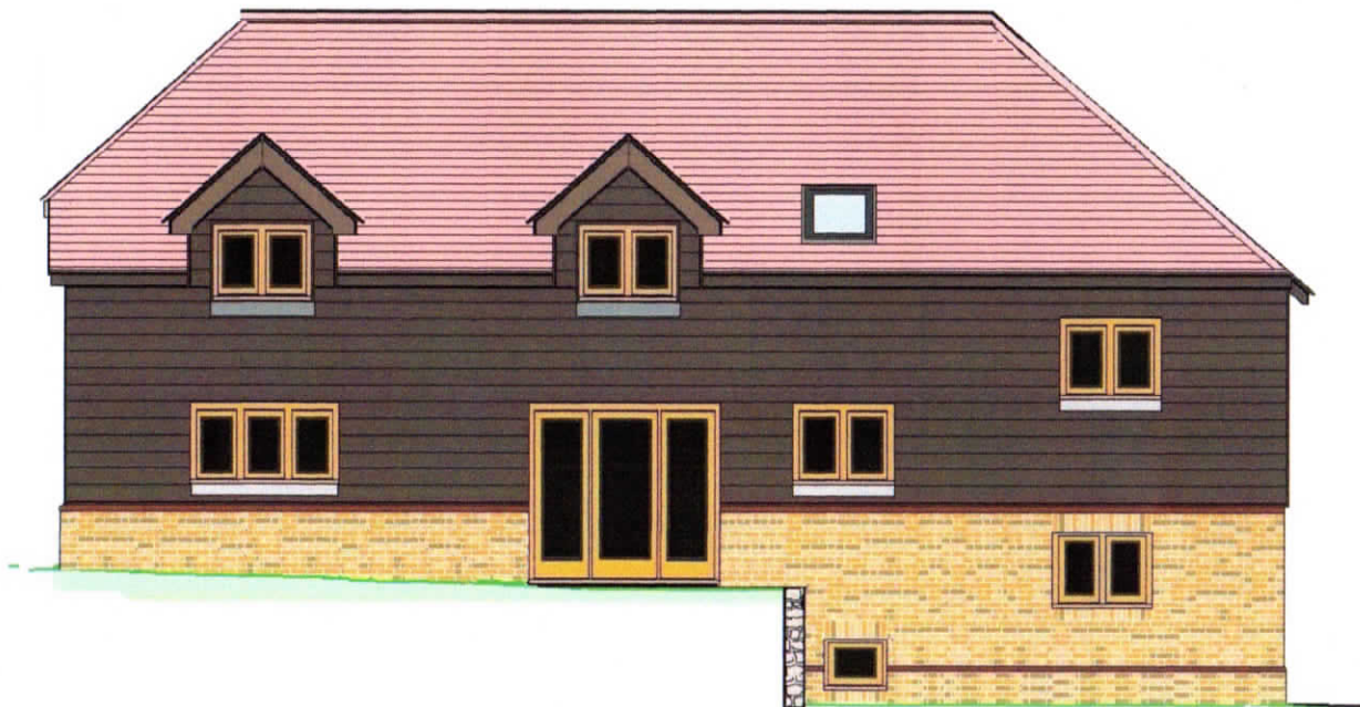
Rear Elevation (NW)