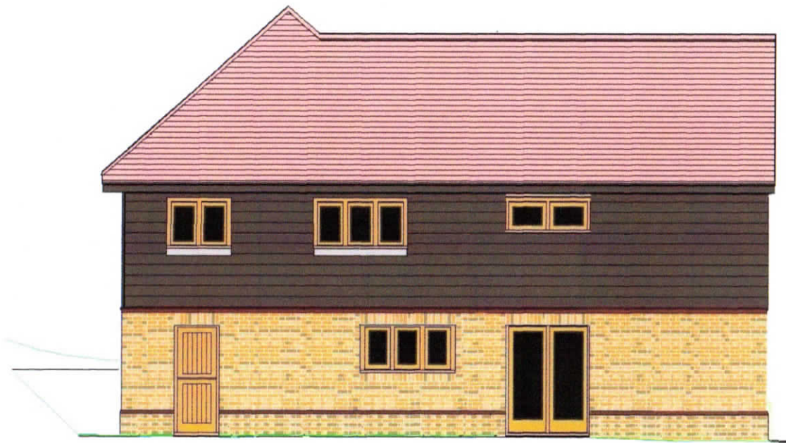
Side Elevation (SW)