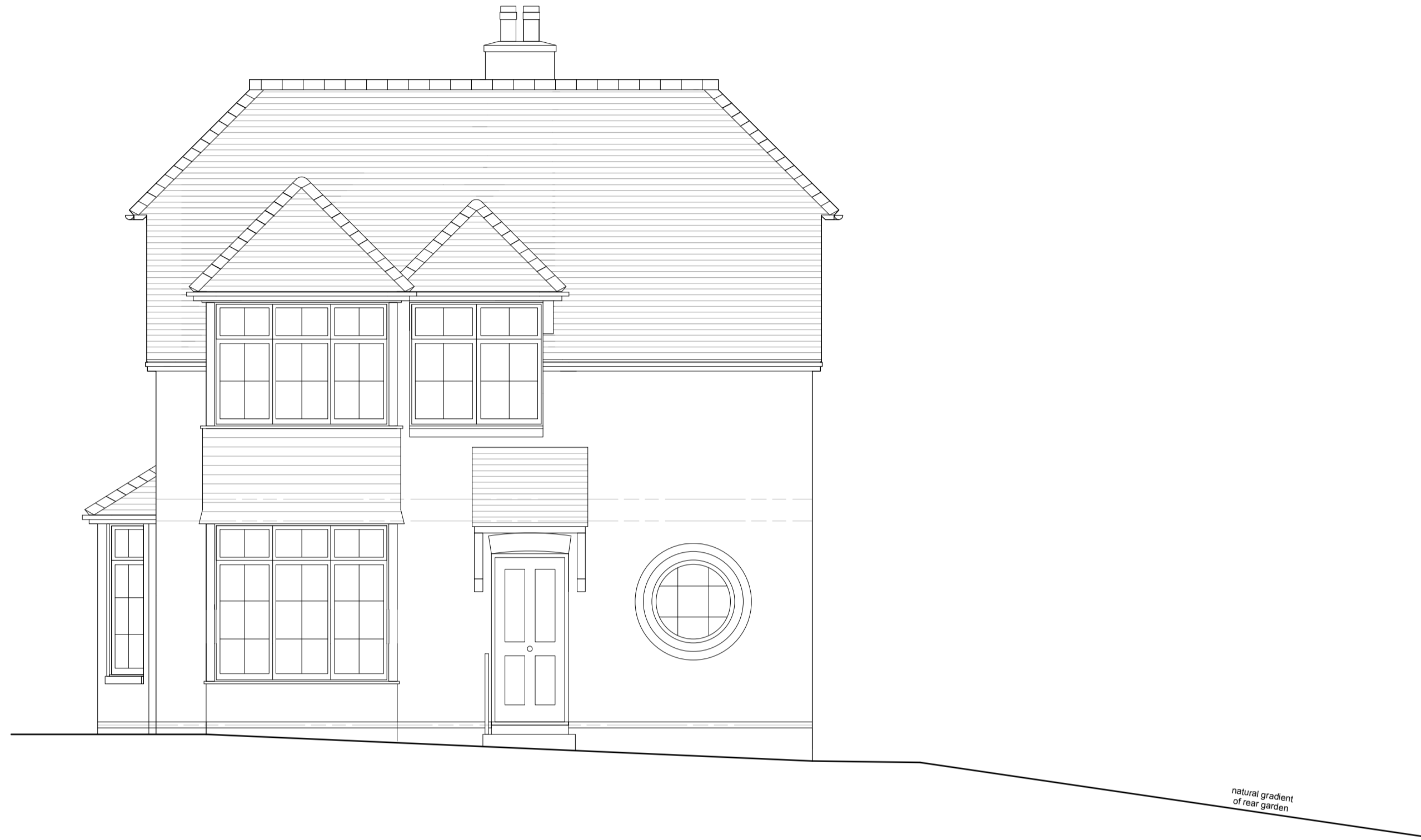
SIDE ELEVATION - SOUTH FACING (AS EXISTING) scale 1:50