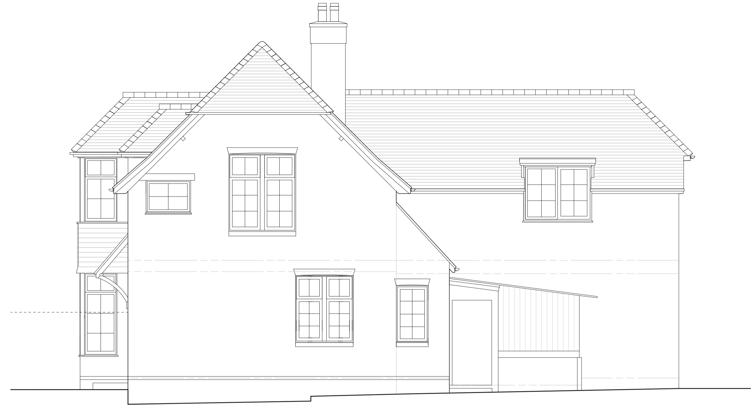
REAR ELEVATION - EAST FACING (AS EXISTING) scale 1:50