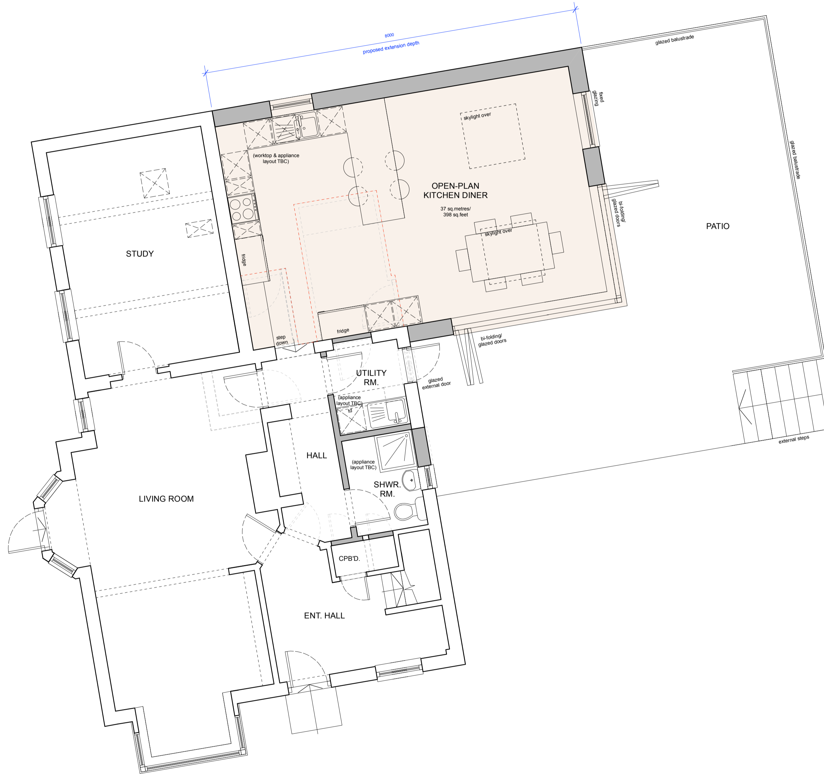
GROUND FLOOR INTERNAL LAYOUT (AS PROPOSED) scale 1:50

Proposed single-storey rear extension (shaded area) Total internal floor area = 37 sq.m/ 398 sq.ft