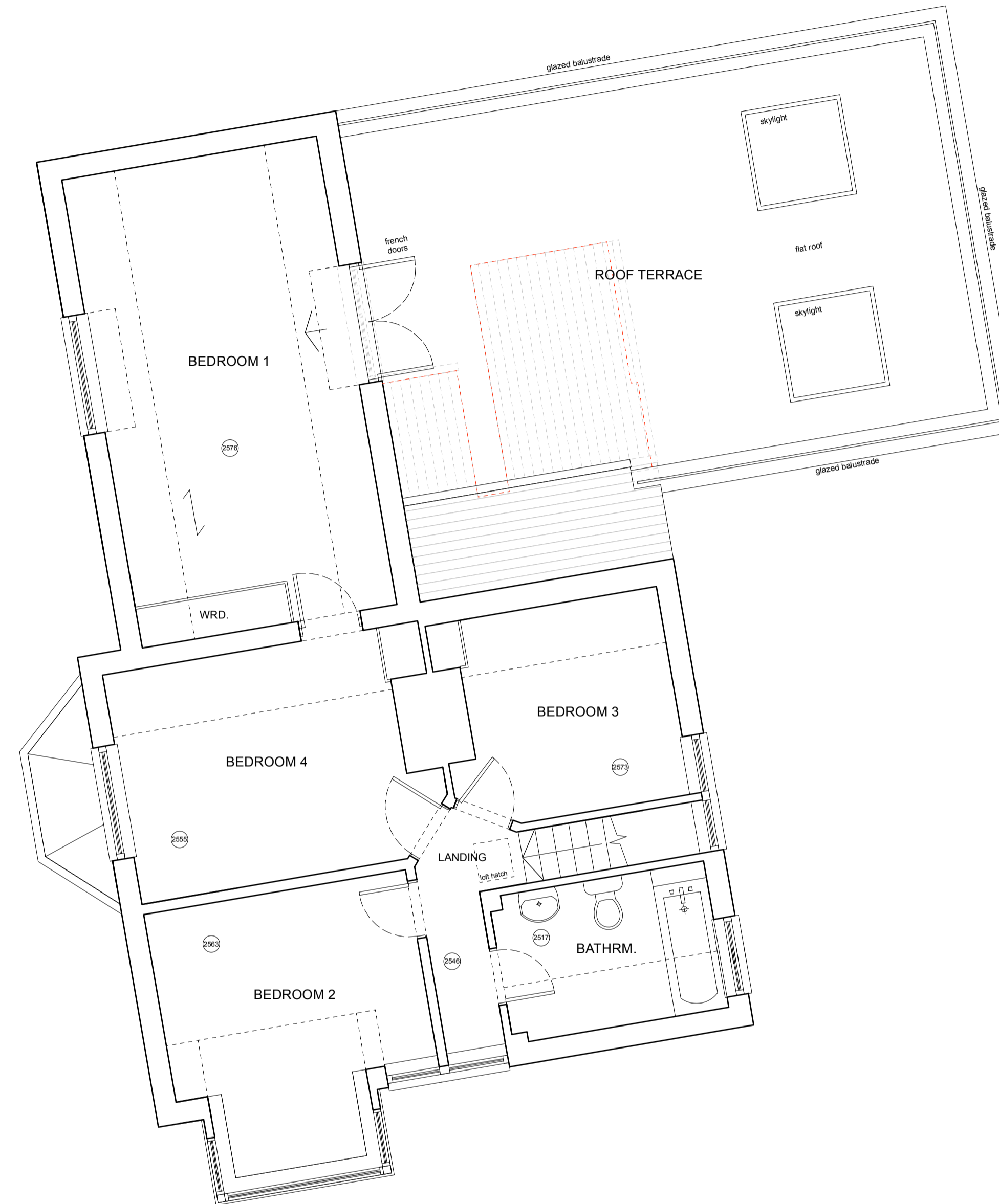
FIRST FLOOR INTERNAL LAYOUT (AS PROPOSED) scale 1:50