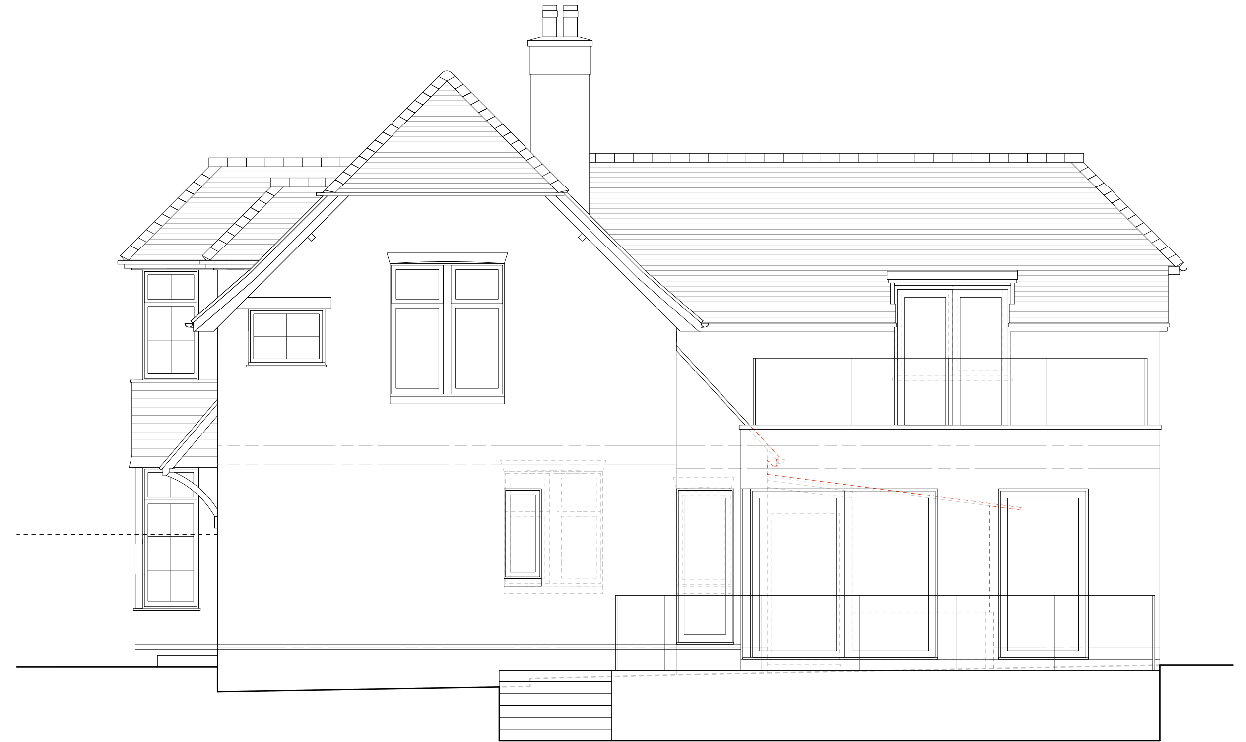
REAR ELEVATION - EAST FACING (AS PROPOSED) scale 1:50