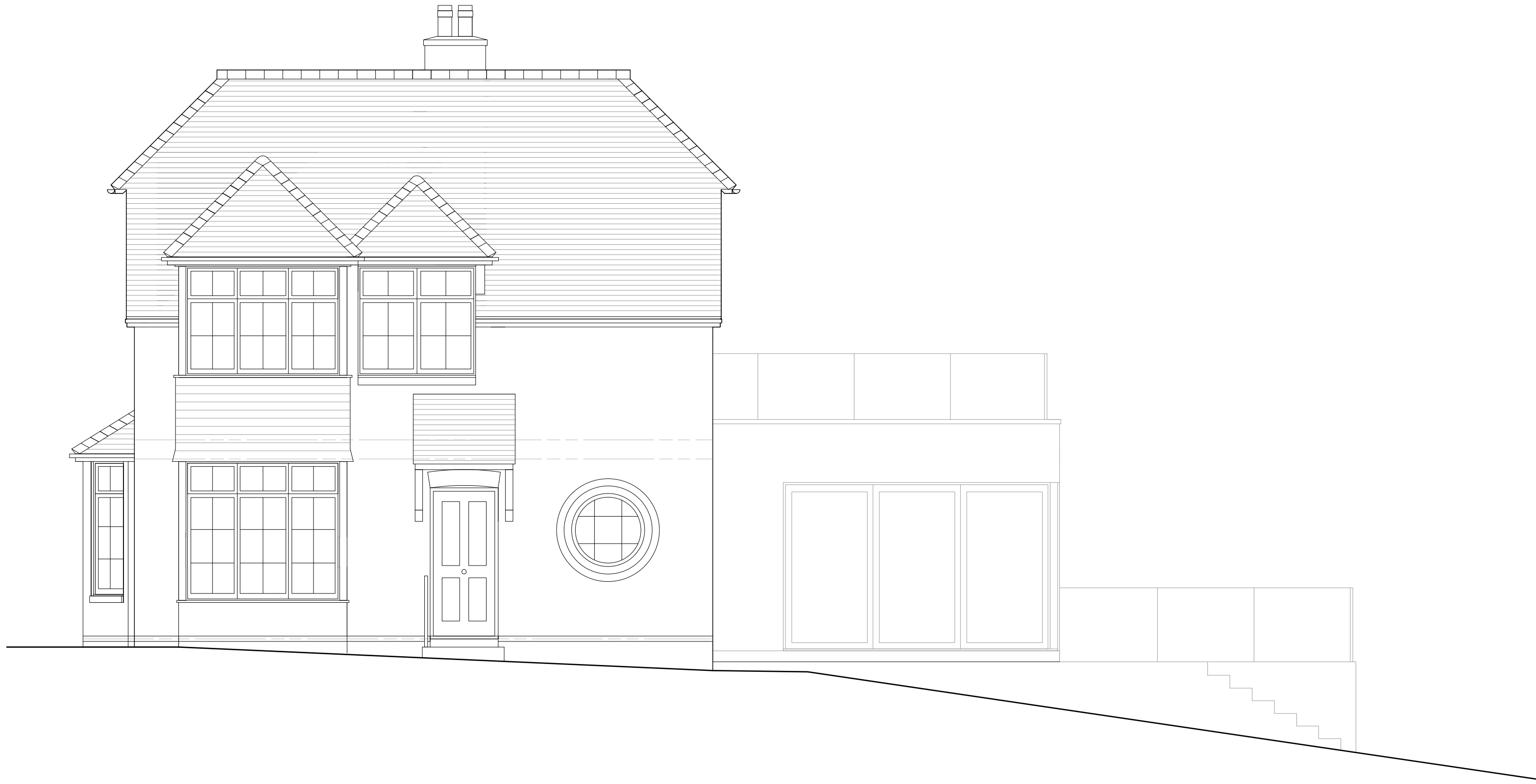
SIDE ELEVATION - SOUTH FACING (AS PROPOSED) scale 1:50