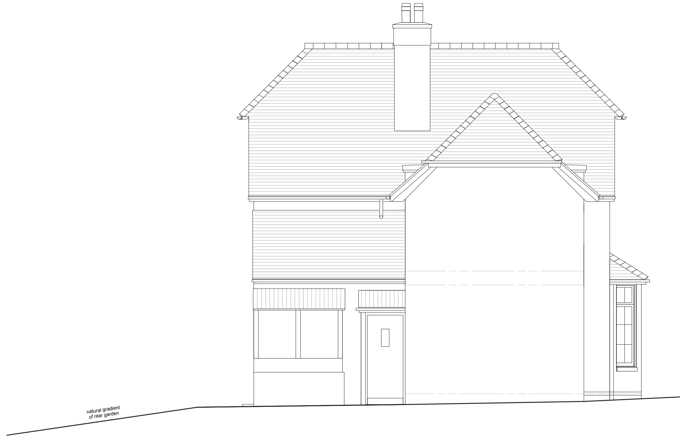
SIDE ELEVATION - NORTH FACING (AS EXISTING) scale 1:50