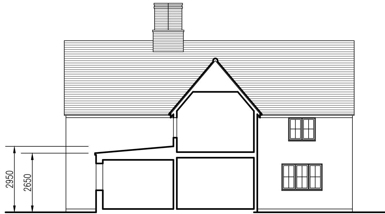
se elevation (b-b)