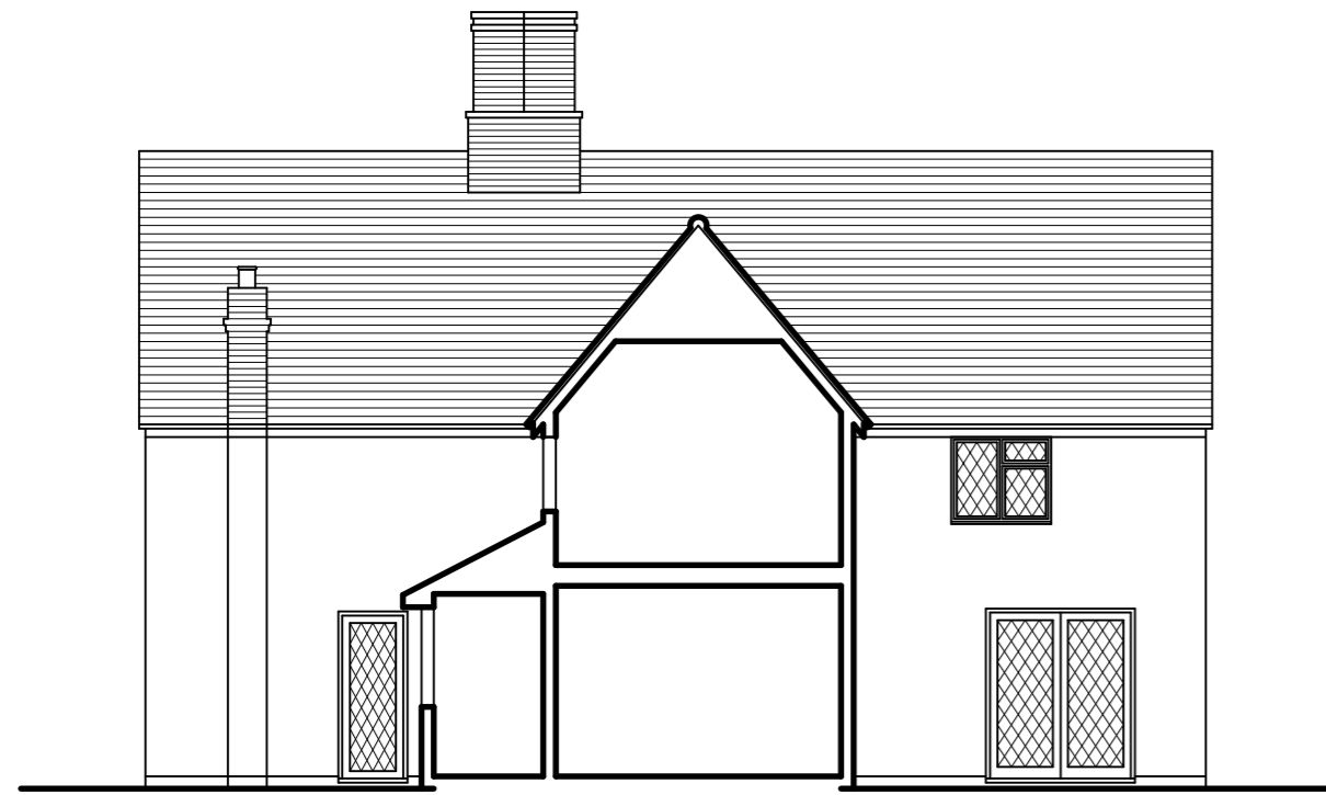
se elevation (b-b)