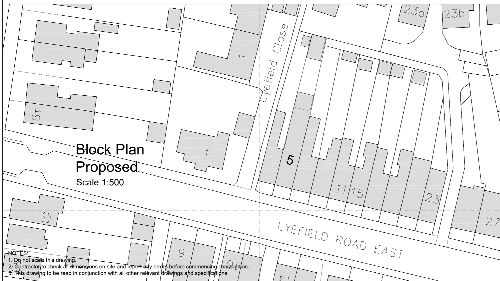
Block Plan Proposed Scale 1:500