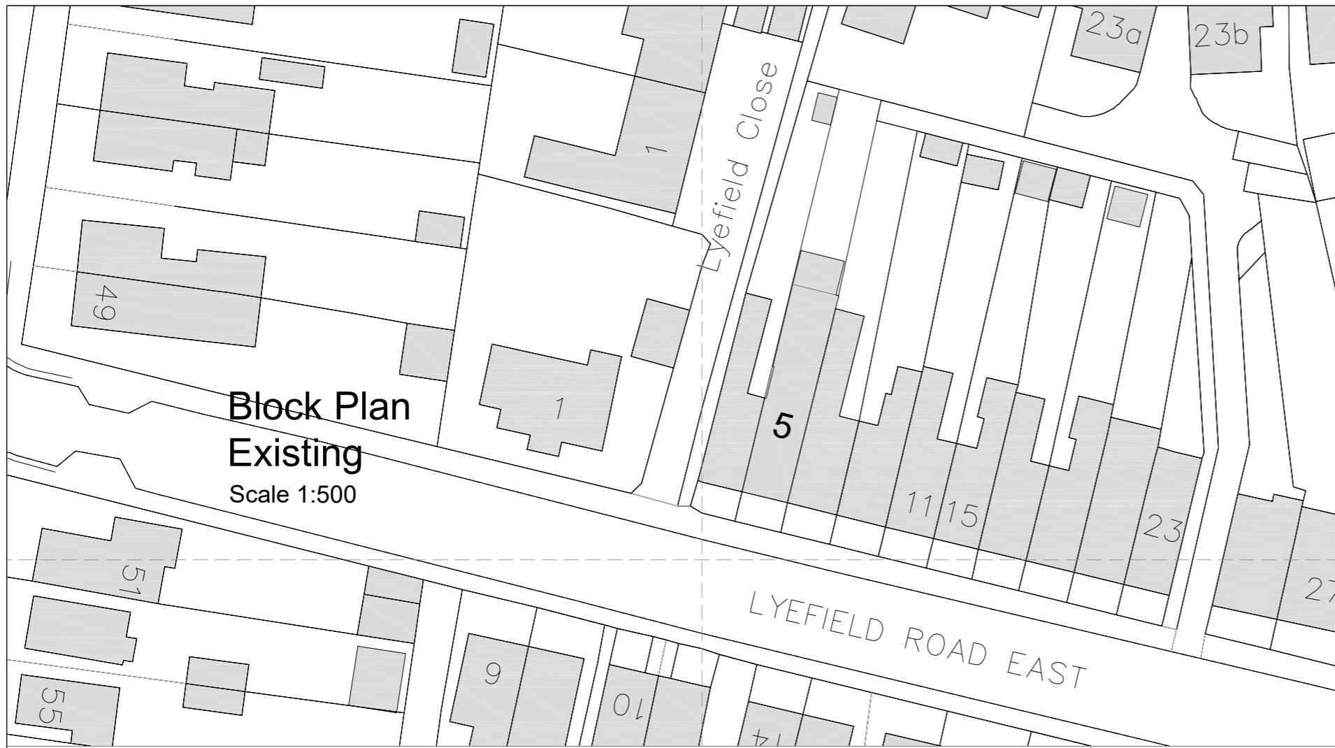
Block Plan Existing Scale 1:500