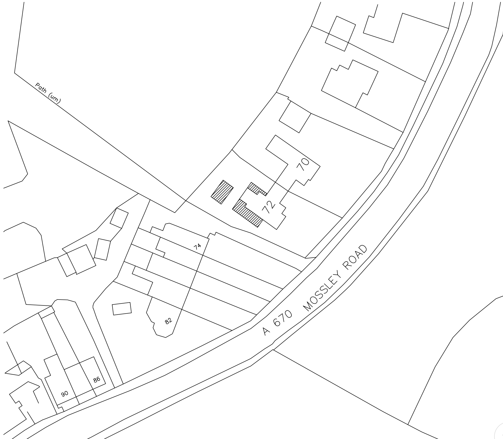
Site Plan Scale 1:500