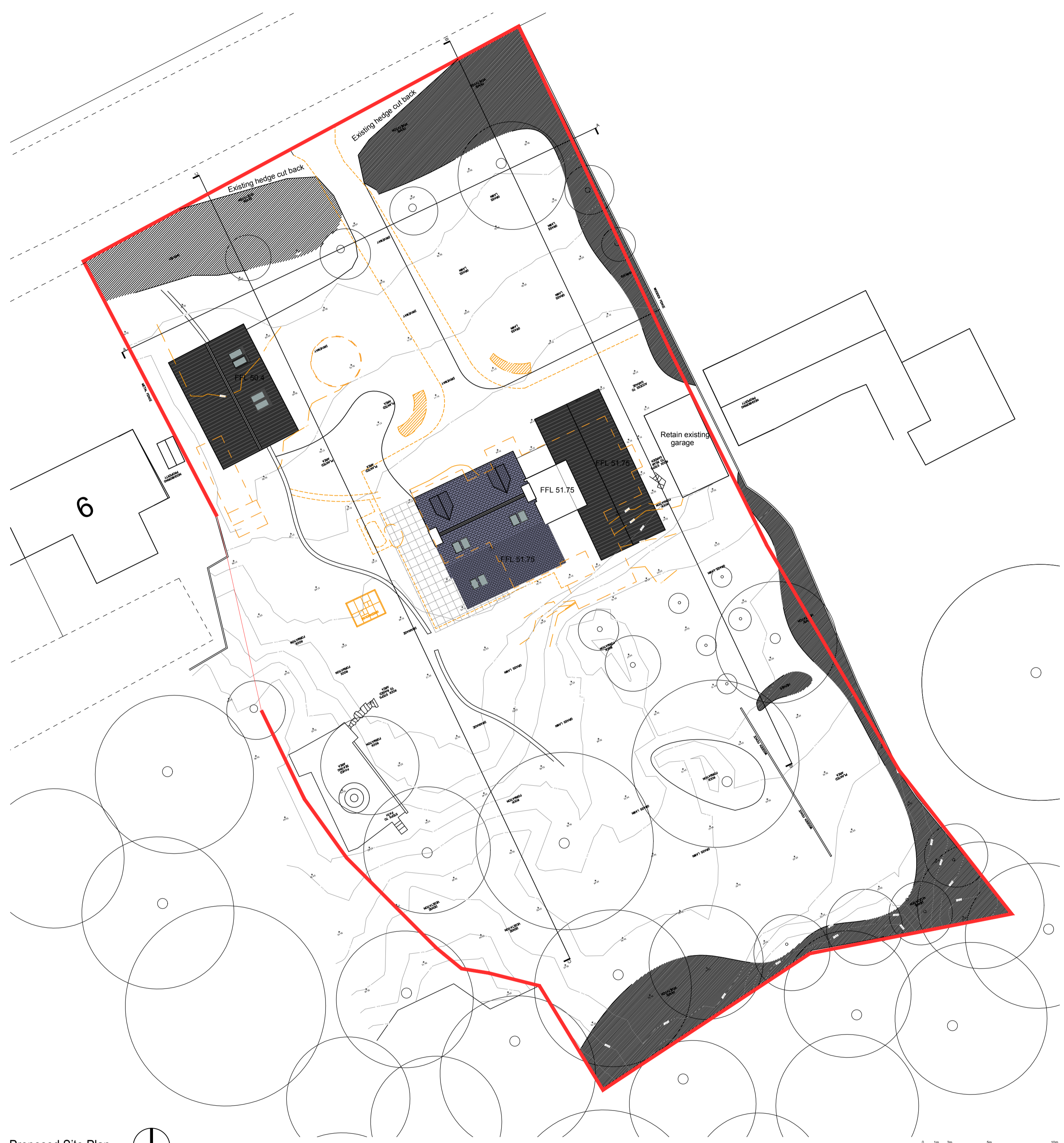
Proposed Site Plan 1:200