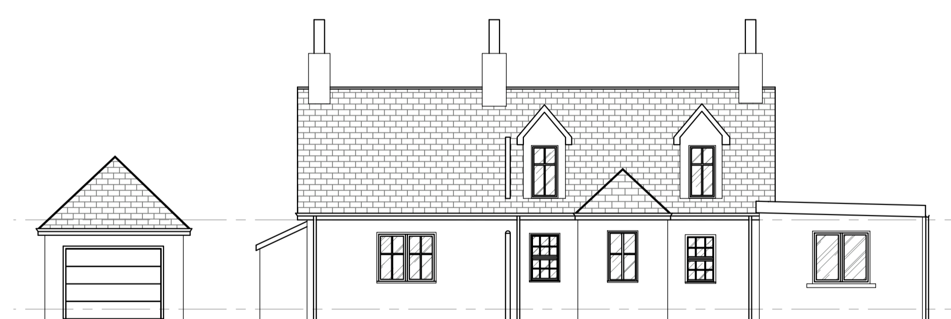
Existing North Elevation 1:100