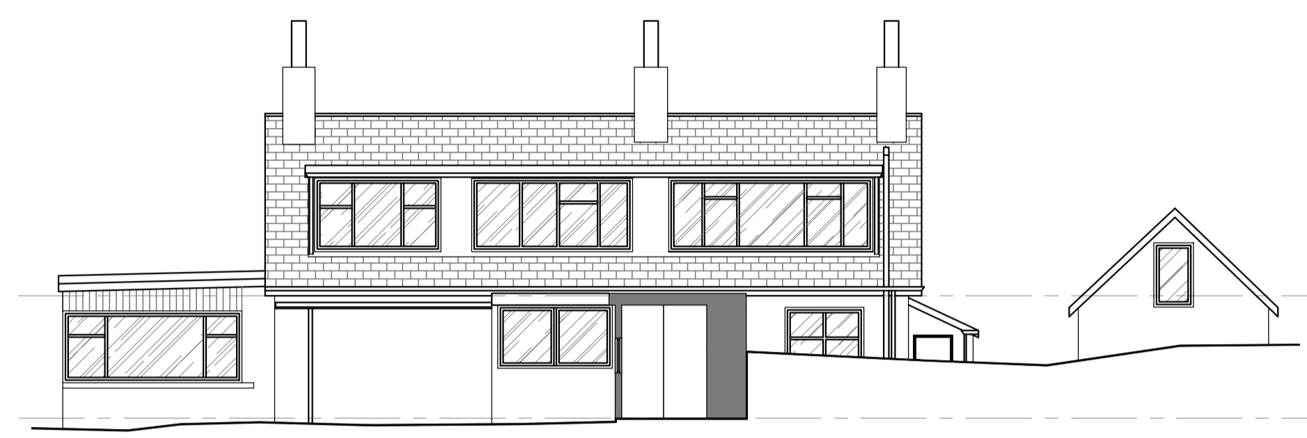
Existing South Elevation 1:100