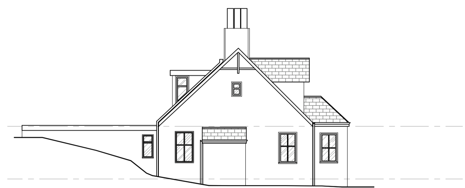
Existing East Elevation 1:100