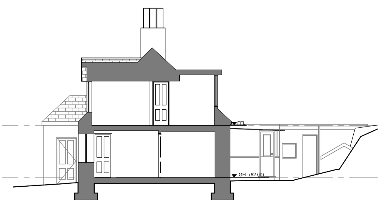
Existing Section B-B 1:100