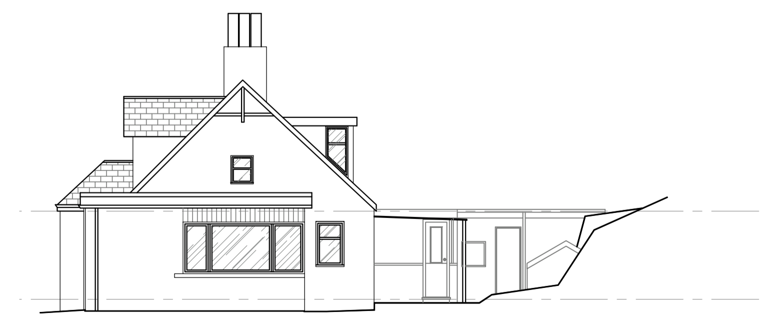
Existing West Elevation 1:100