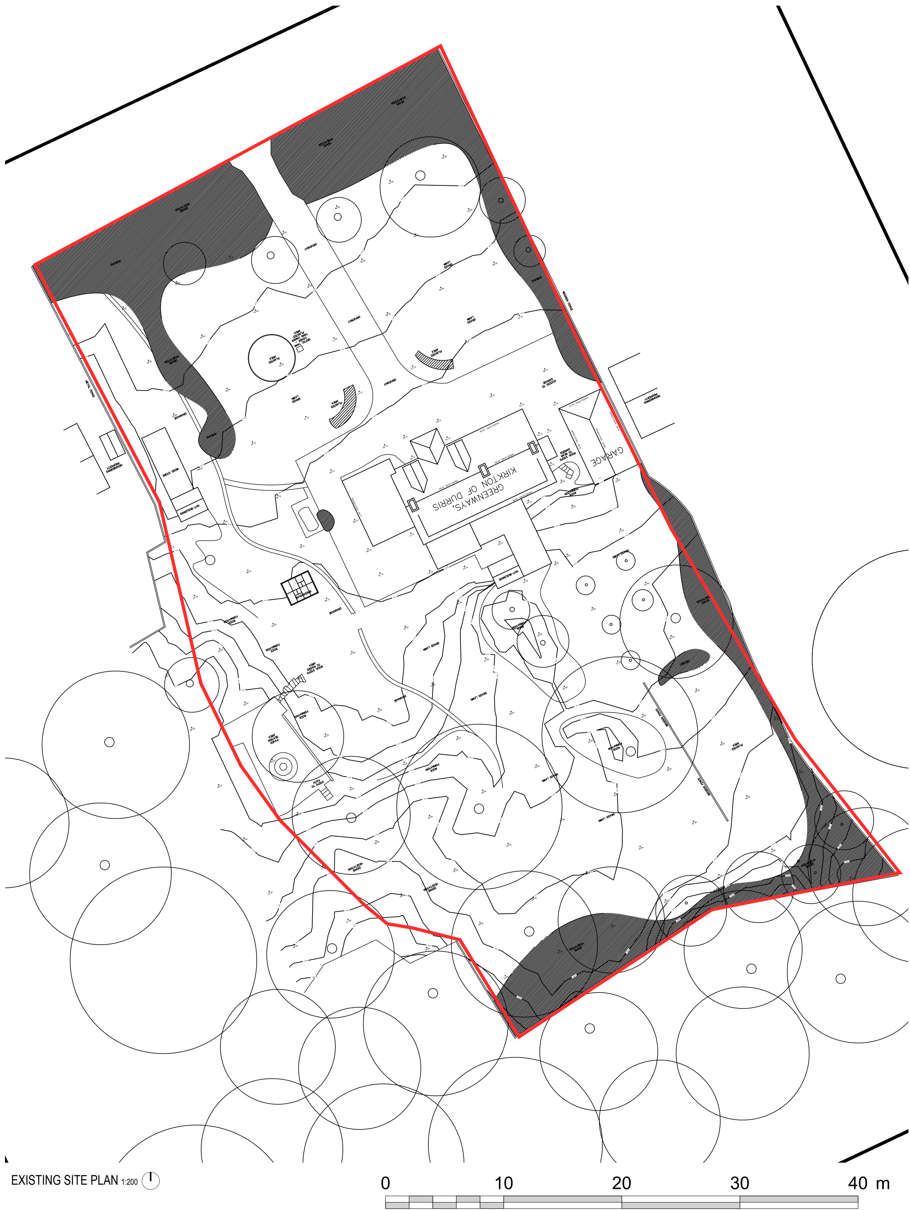
EXISTING SITE PLAN 1:200