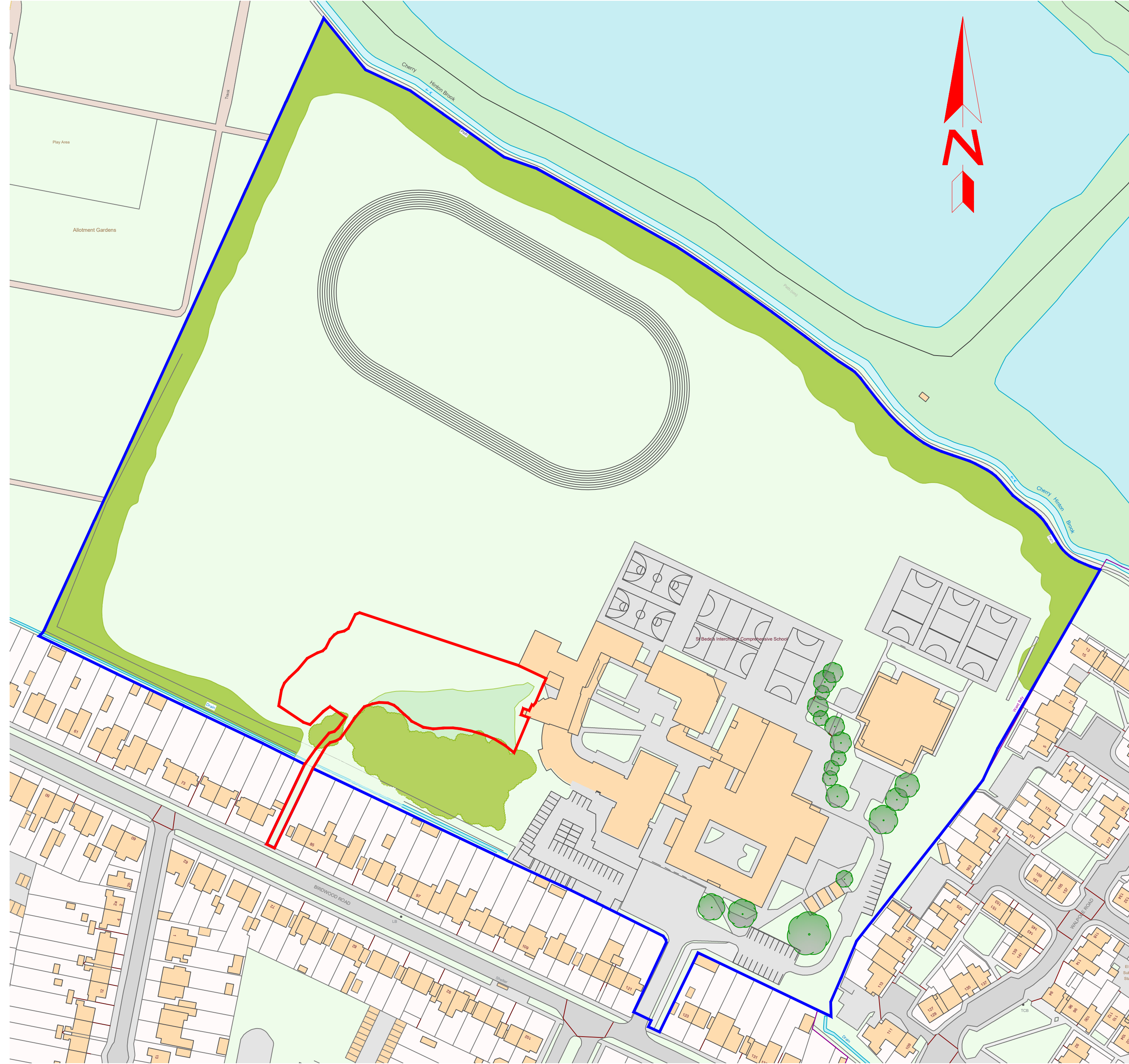
1 Existing Site Layout Scale: 1:1250