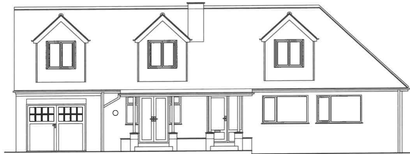
FRONT ELEVATIONS 1:100