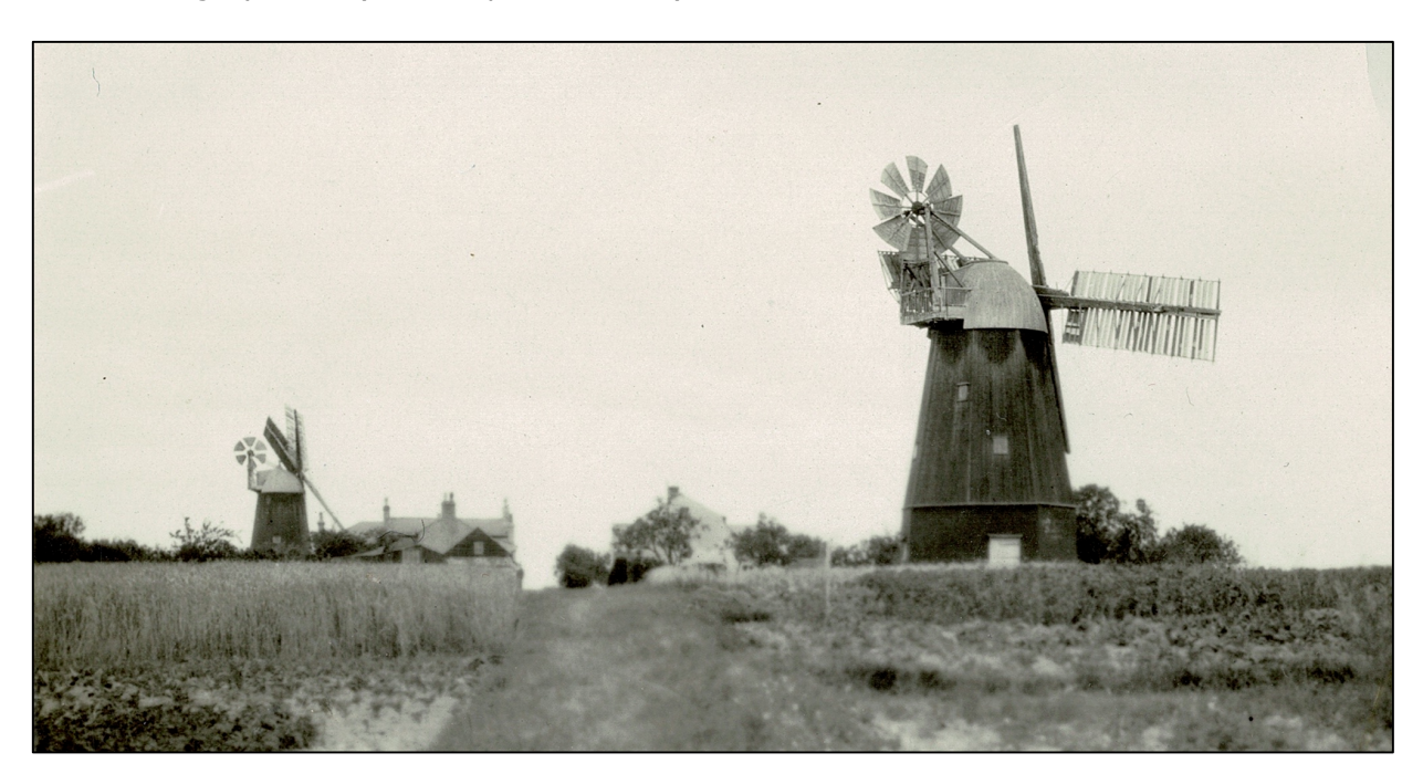
Figure 1: Swaffham Prior windmills c1925, photographed looking up the track towards the north west. The tower mill is on the left and the smock is on the right. The smock has lost one pair of sails but is otherwise in working order and the fantails of both mills are working correctly as they are both facing the same direction.

No mill is marked on the tower mill site at this date, though references to one begin to appear in 1839. The tower mill is known to have been erected by Robert Fyson of Soham in 1857-58, as it was working by 1859 (J. Cook pers. comm.).