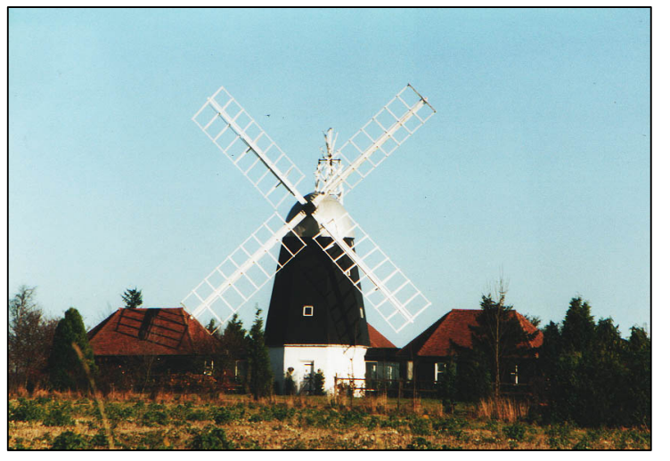
Figure 5: The completed residential conversion in 1999.