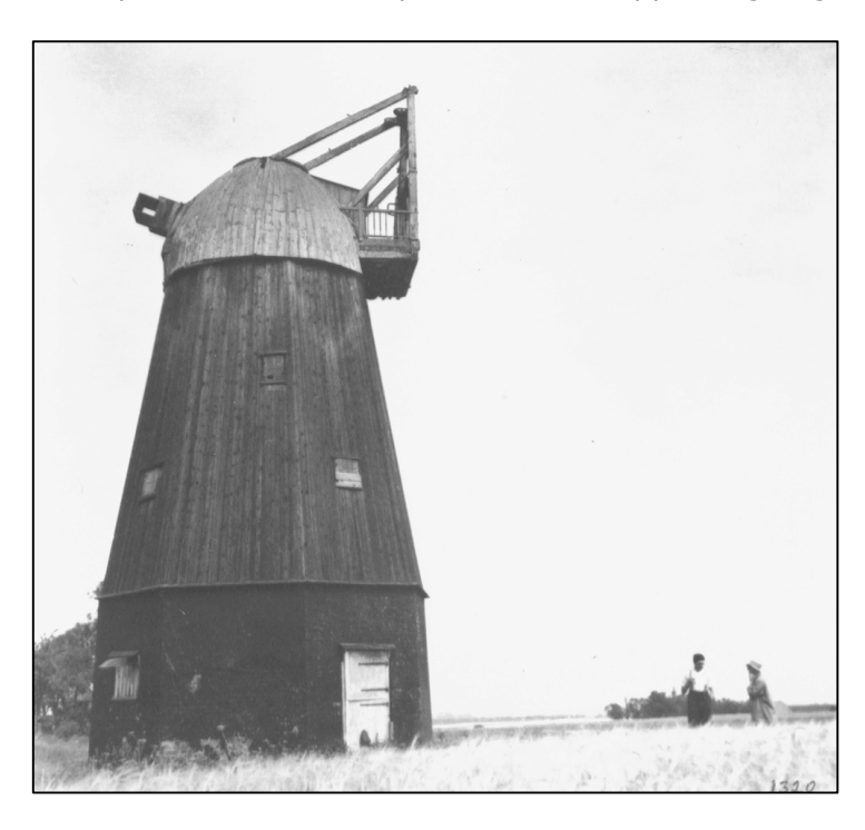
Figure 3: Swaffham Prior smock mill following the removal of the sails, photographed by Harry Meyer in 1935 (Mills Archive).

The smock mill was offered for sale Aug 1927 with ¼ acre of ground (Simmons). Photographs of both mills taken in the early or mid-1920s show the smock mill had lost one pair of sails but its other pair remained complete, the mill appearing in good order overall (Figure 1).