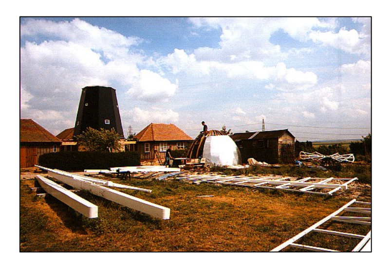
Figure 4: Reconstruction of the cap and sails by R. Thompson & Son in progress, c1990

These elements completed the present appearance of the smock mill as a static landmark.