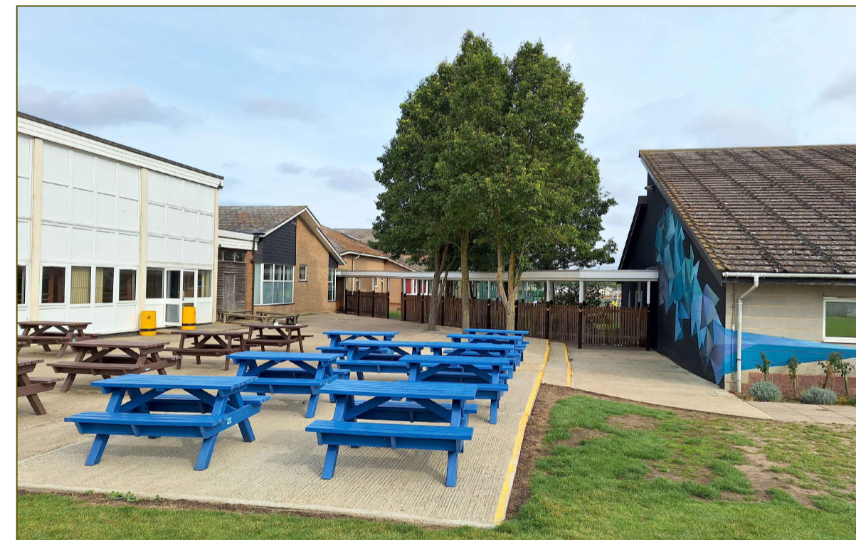
2 View of courtyard seating and setting for new extension. Dark painted blockwork reflects existing composite timber panelling on building opposite