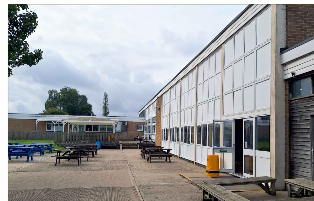
7 View along gym facade with timber infill to the foreground and glint of existing dark composite cladding in the background.