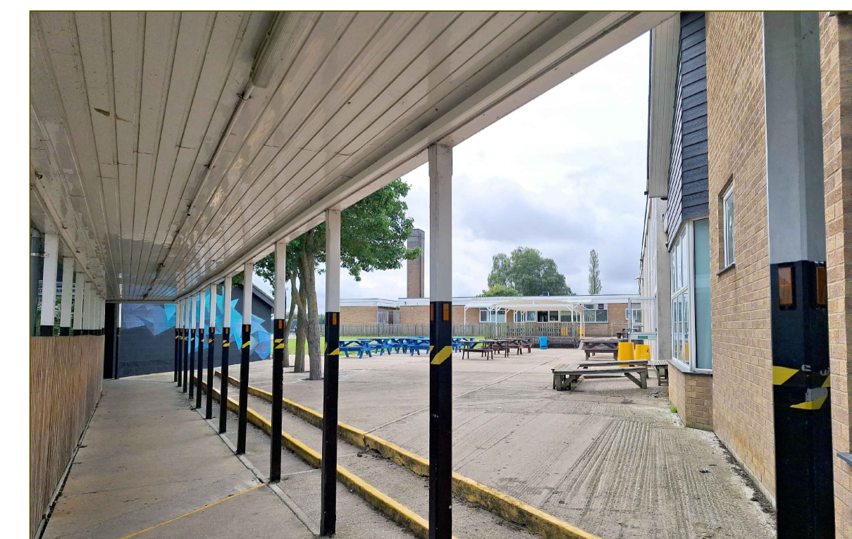
8 View under colonnade towards courtyard. Vibrant artwork emphasised by dark background.