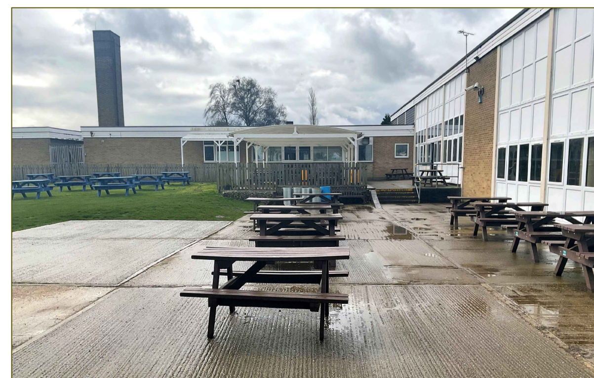
6 View across courtyard to lower brick block and stepped seating area.