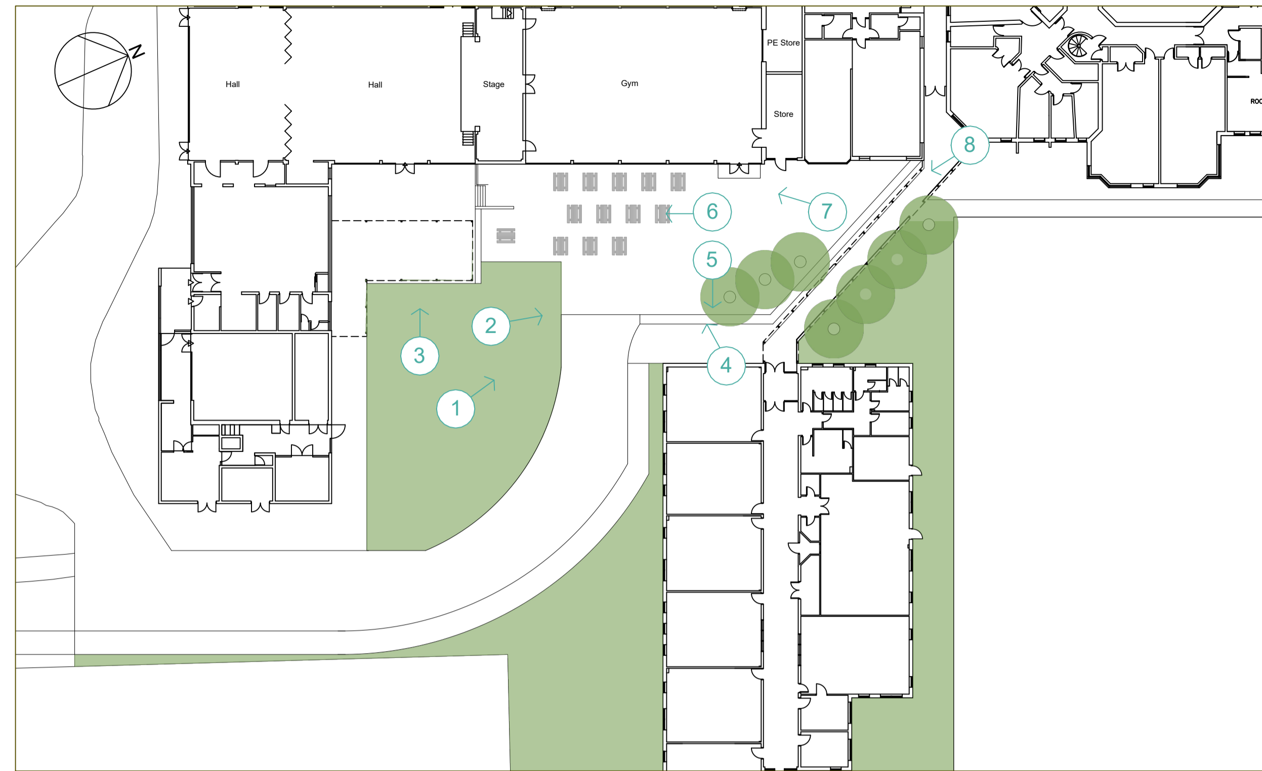
Key Plan - Existing Site Plan NTS