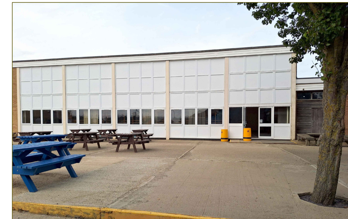
4 View across courtyard towards existing gym. Existing white uPVC cladding panels.