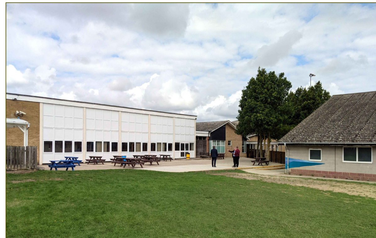
1 View from field towards existing gym and courtyard. Proposed location of new extension.