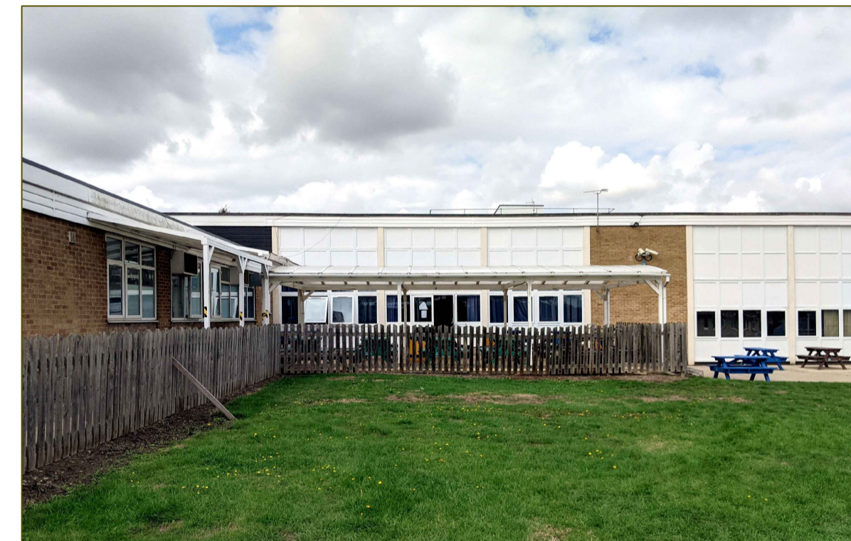
3 View of hall with external canopy structure. Existing dark composite timber panelling above kitchen.