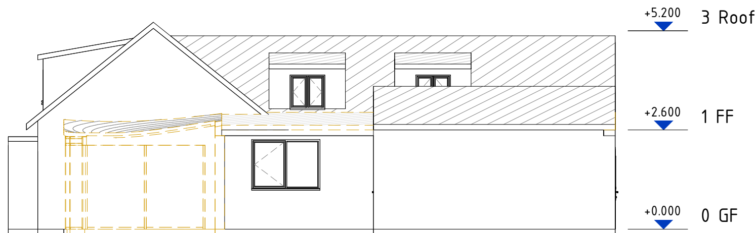
1 East Demo 1 : 100

18, Grange Close, Ludham, Great Yarmouth, Norfolk NR29 5PZ