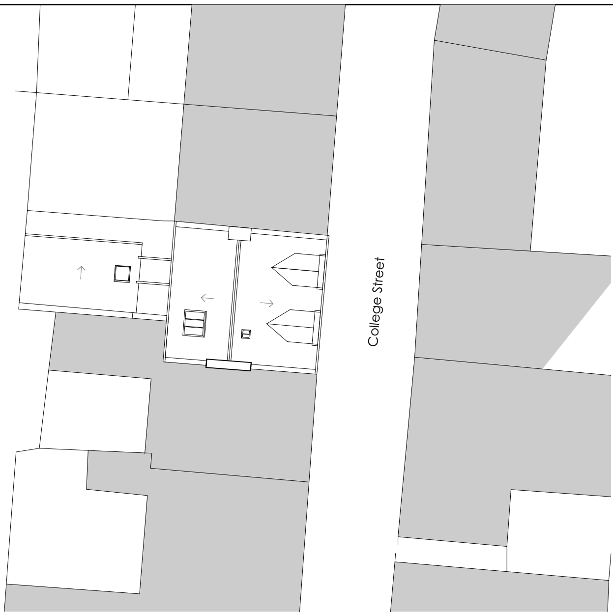
Roof Plan 1:200 @ A4