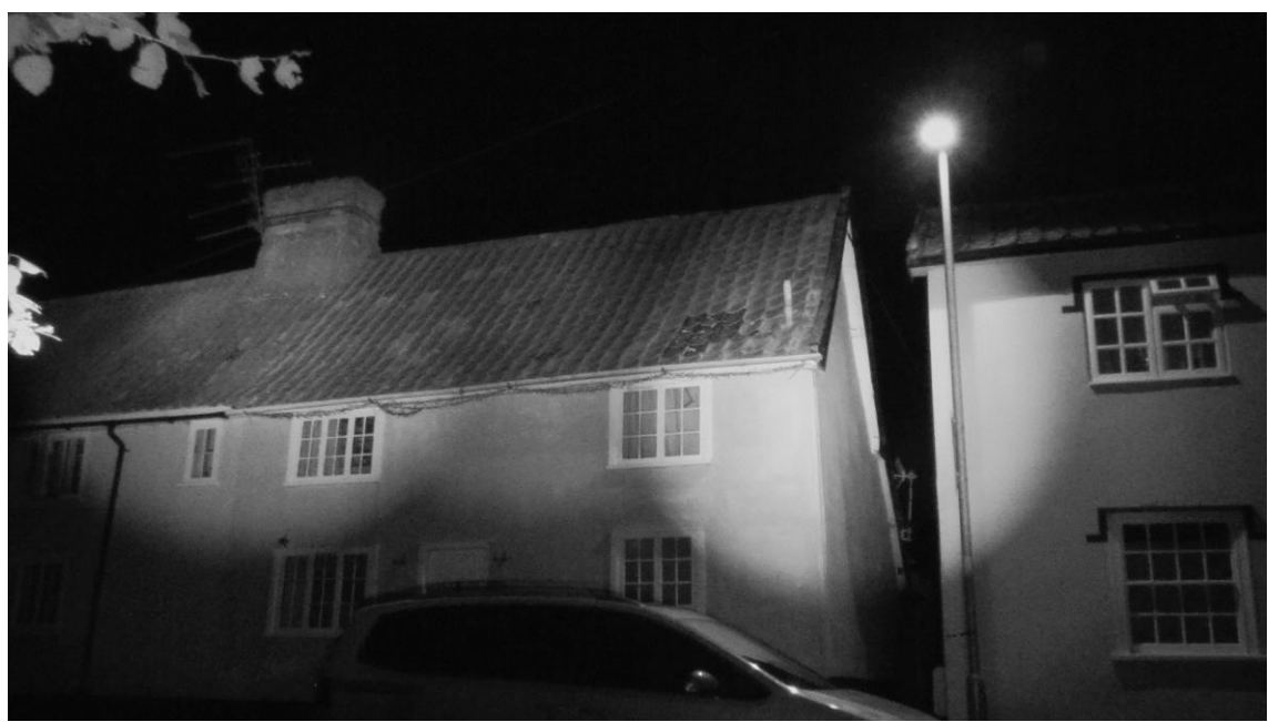
Photo 1, screenshot from infrared camera on the west aspect. 24<sup>th</sup> August 2023.