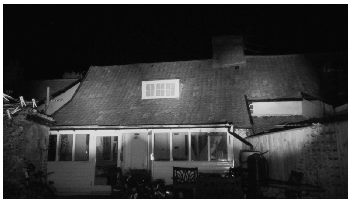
Photo 2, screenshot from infrared camera on the east aspect. 24<sup>th</sup> August 2023.