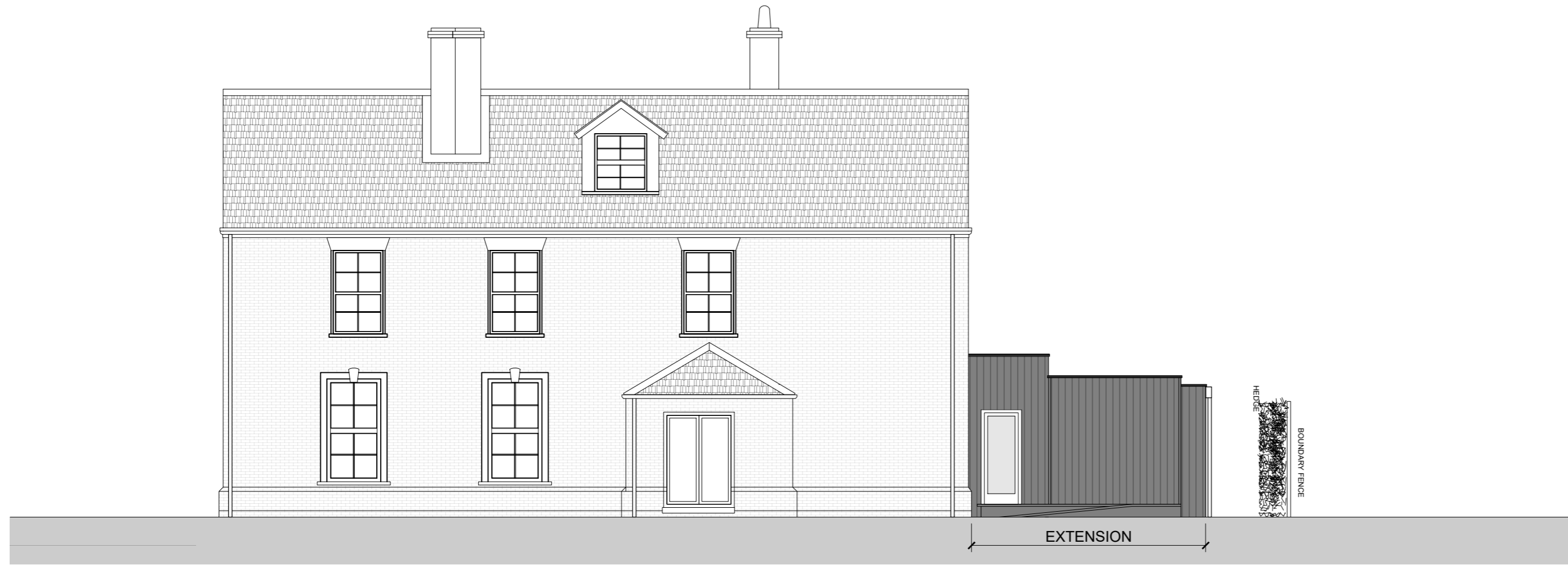
3 East Elevation Proposed Scale 1:100