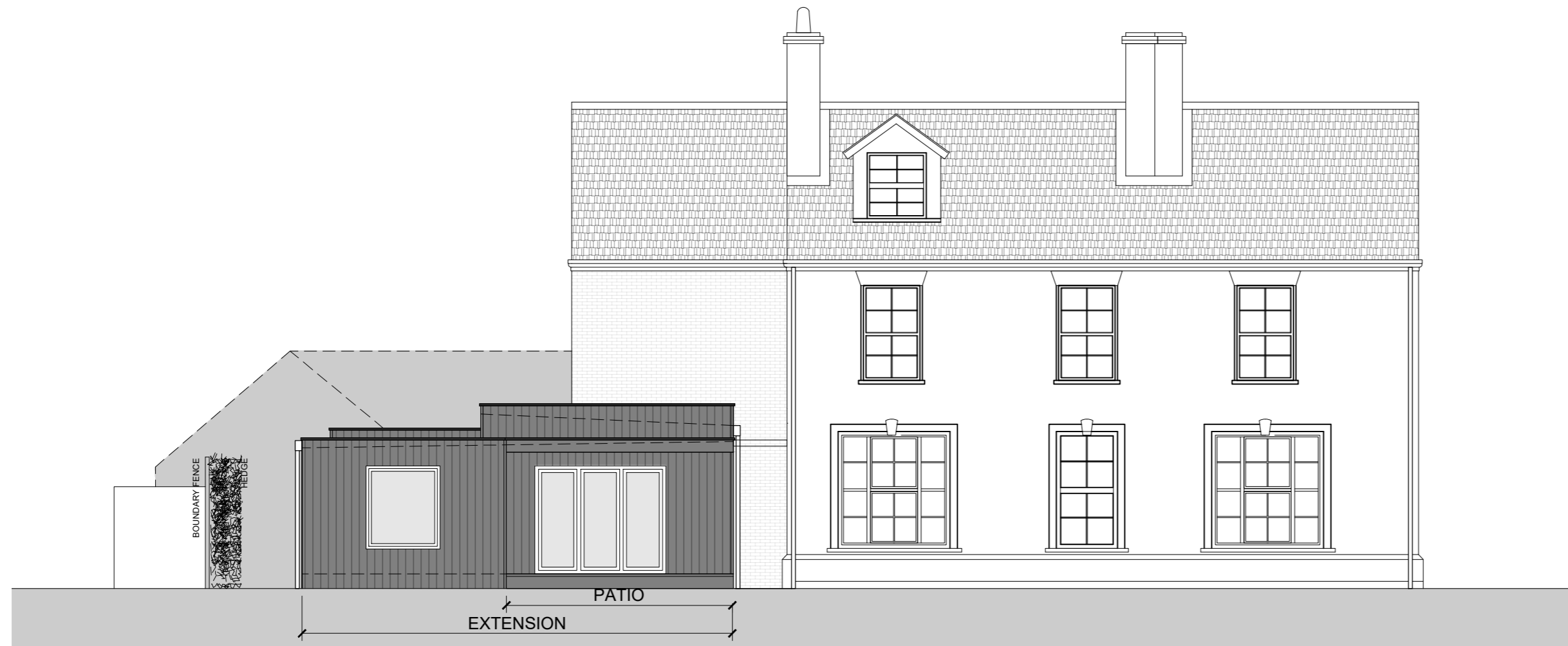
4 West Elevation Proposed Scale 1:100