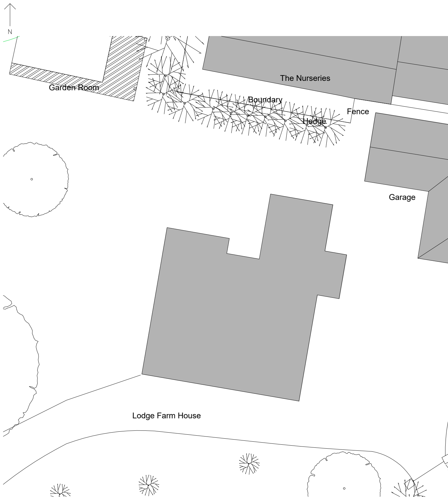
1 Block Plan Existing Scale 1:200