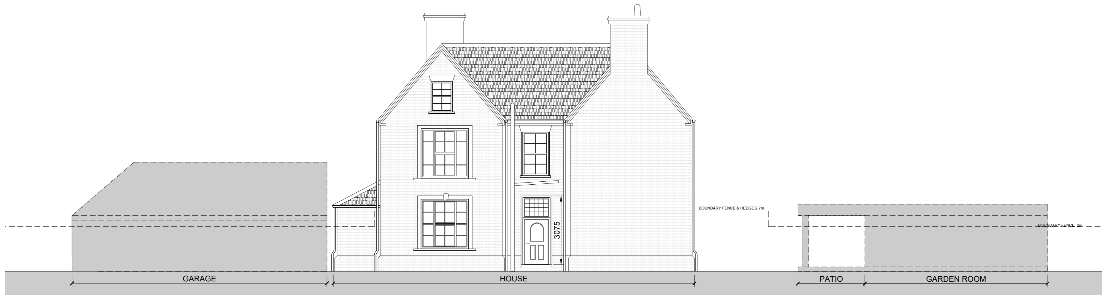
2 Rear - North Elvation Existing Scale 1:100