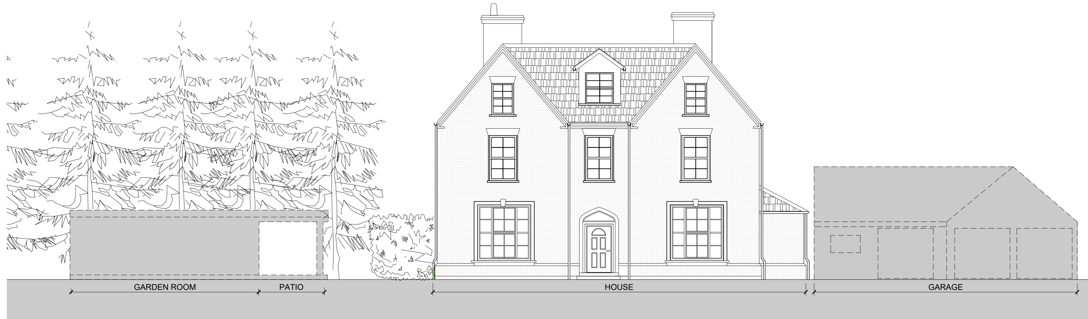
1 Front - South Elvation Existing Scale 1:100