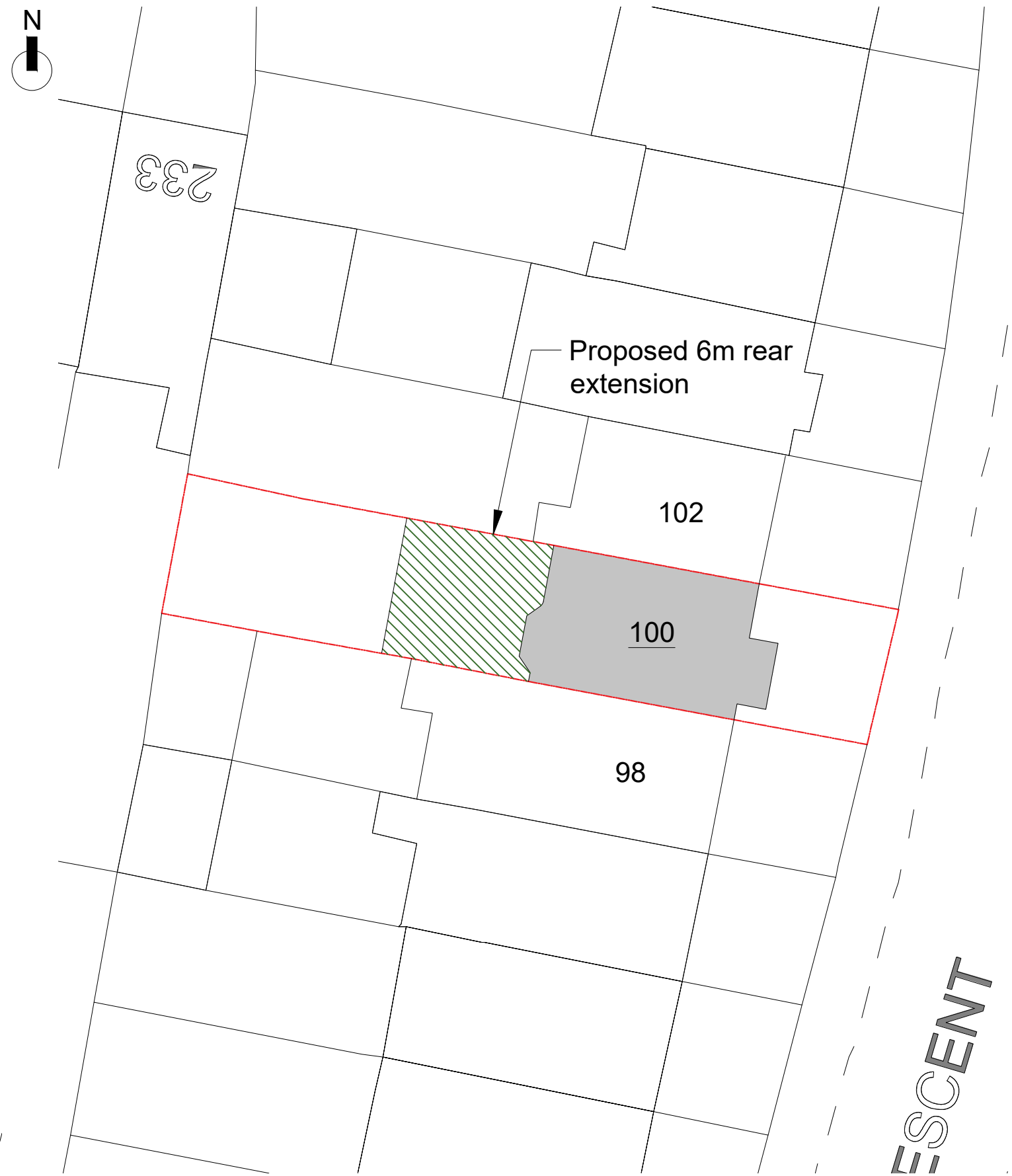
PROPOSED BLOCK PLAN scale 1:200