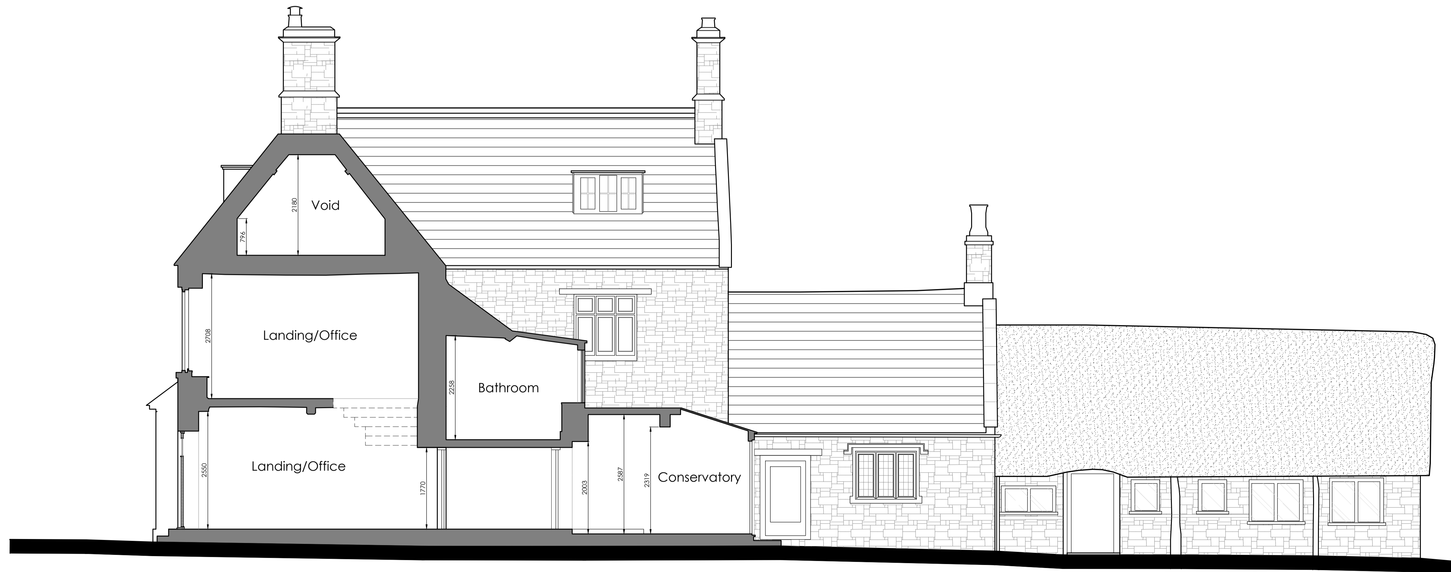
Existing Section B-B