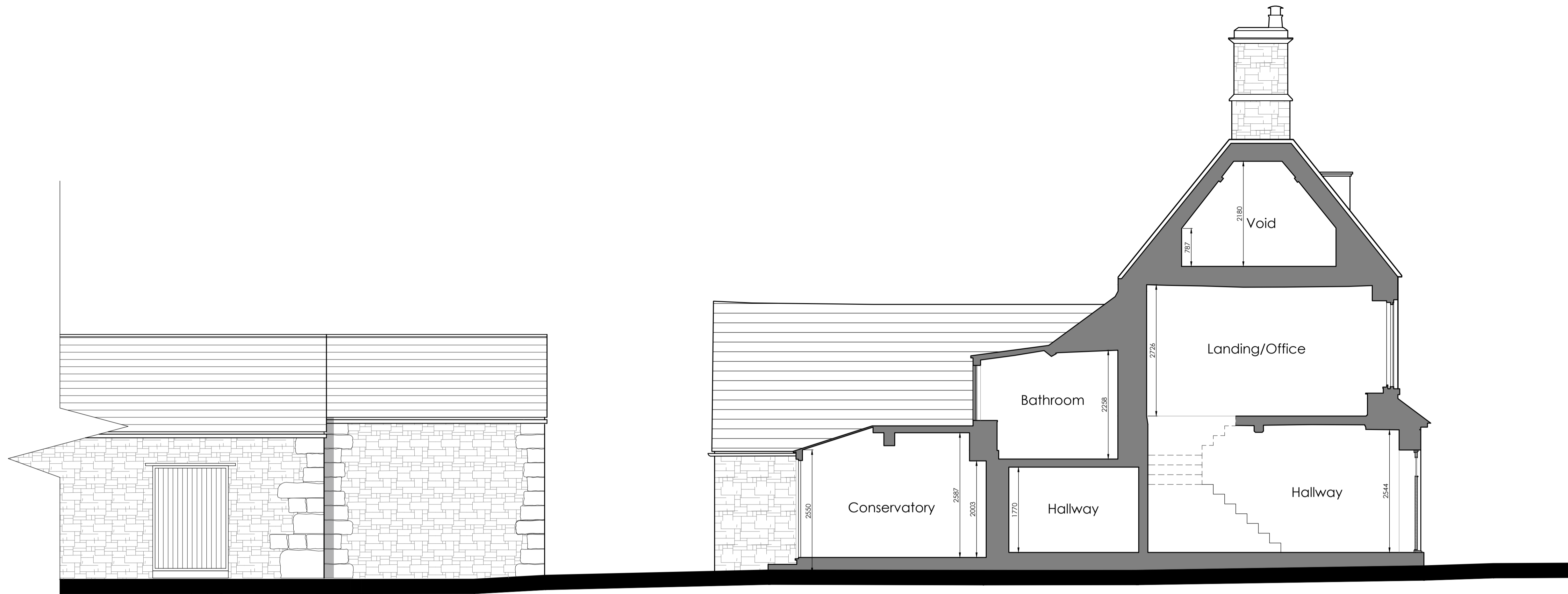
Existing Section A-A