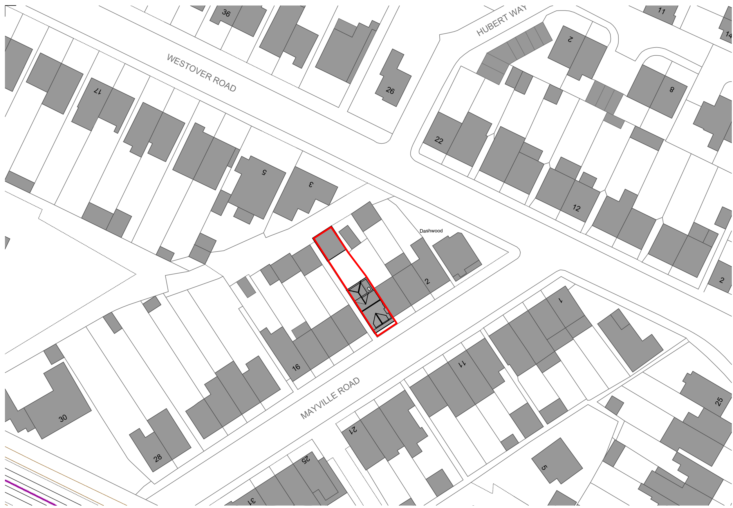
Proposed Site Plan Scale 1:500